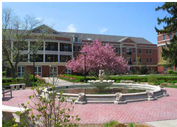
The Osborn in Rye is the only community in Westchester County to receive this honor

Neighbors Link is headquartered in Mount Kisco, has three locations in Westchester County and offers services throughout the Mid-Hudson Valley. For more information on locations or programs, please call us at 914-666-3410.