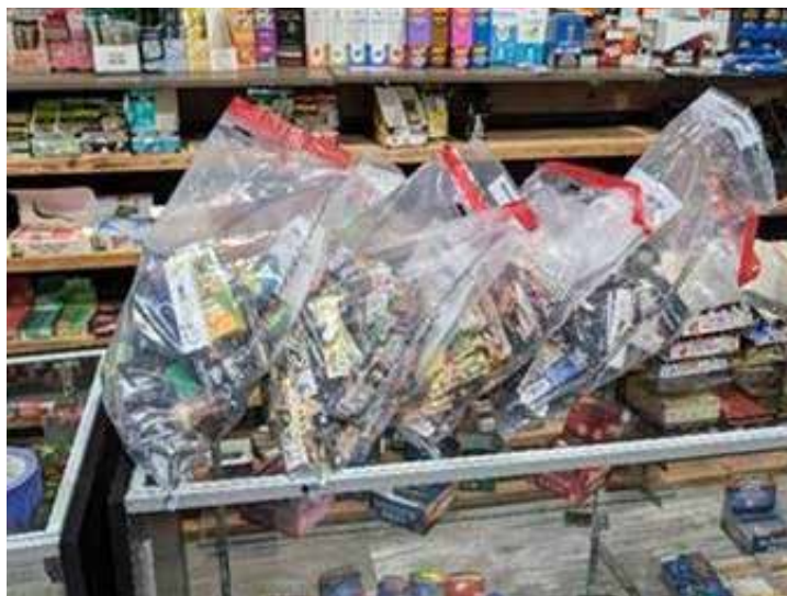
left-illegal THC products seized by YPD

Mayor Spano is correct to ask why are there SIX LEGAL Cannabis stores, all on Central Avenue?