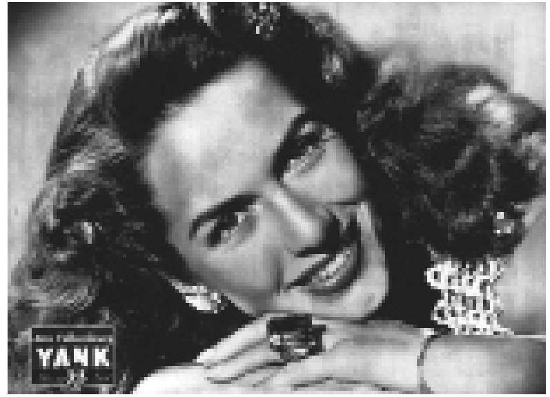
Jinx Falkenburg in 1945; Army photo was in Yank, the Army Weekly