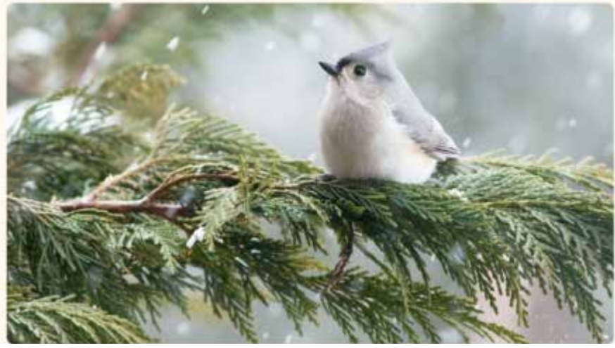
Tufted Titmouse.

The nation's longest-running community science bird project fuels Audubon's work throughout the year. The Christmas Bird Count occurs December 14 to January 5 every season. Sign up to receive information and results about all of Audubon's community science programs through American Birds, our email newsletter.