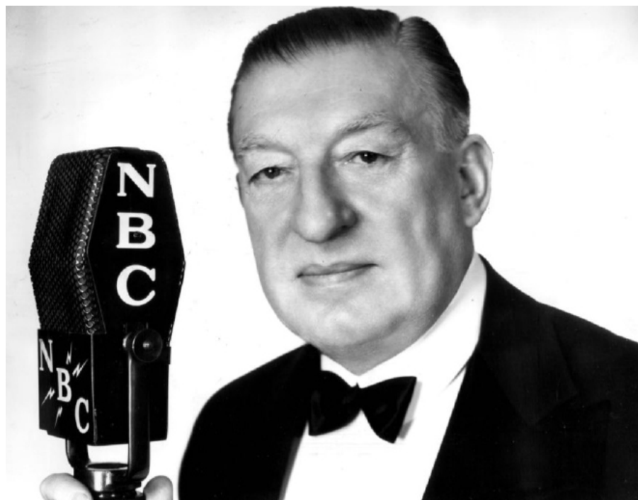
The popular Major Bowes Amateur Hour on NBC Radio, in the 1930's - 40's