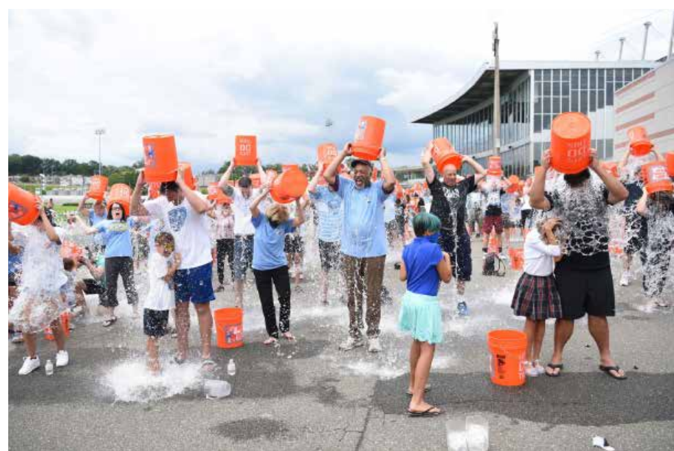
hundreds take the ice bucket challenge above, photo by Jelena Gerga