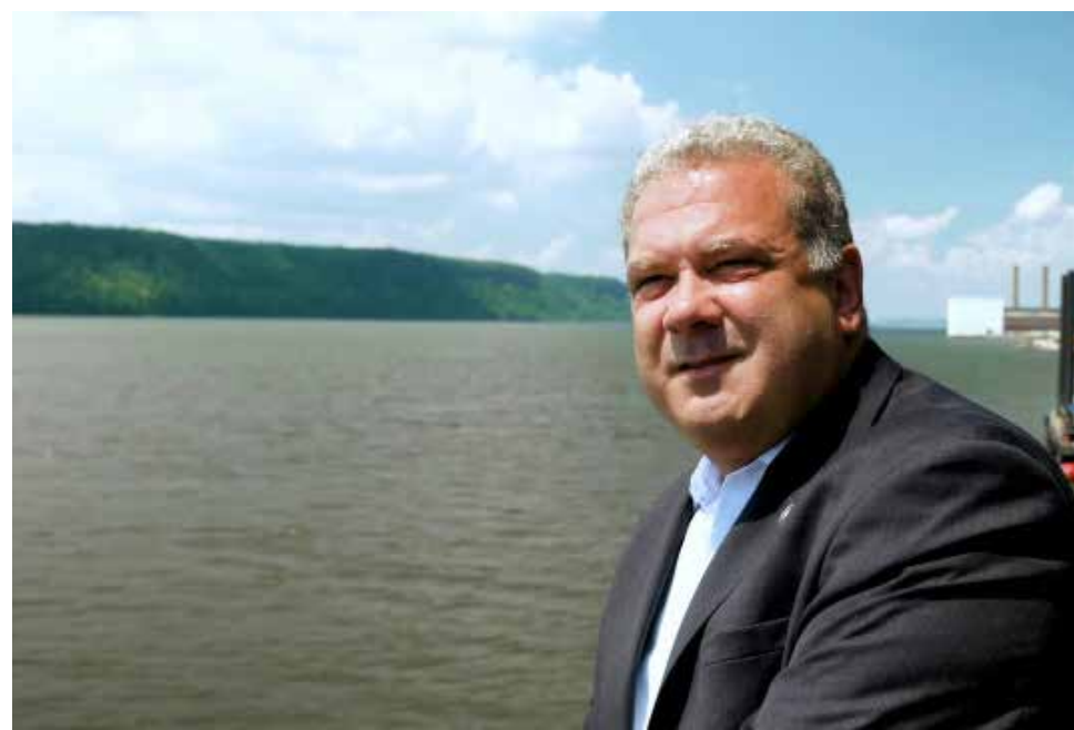
Yonkers Mayor Mike Spano