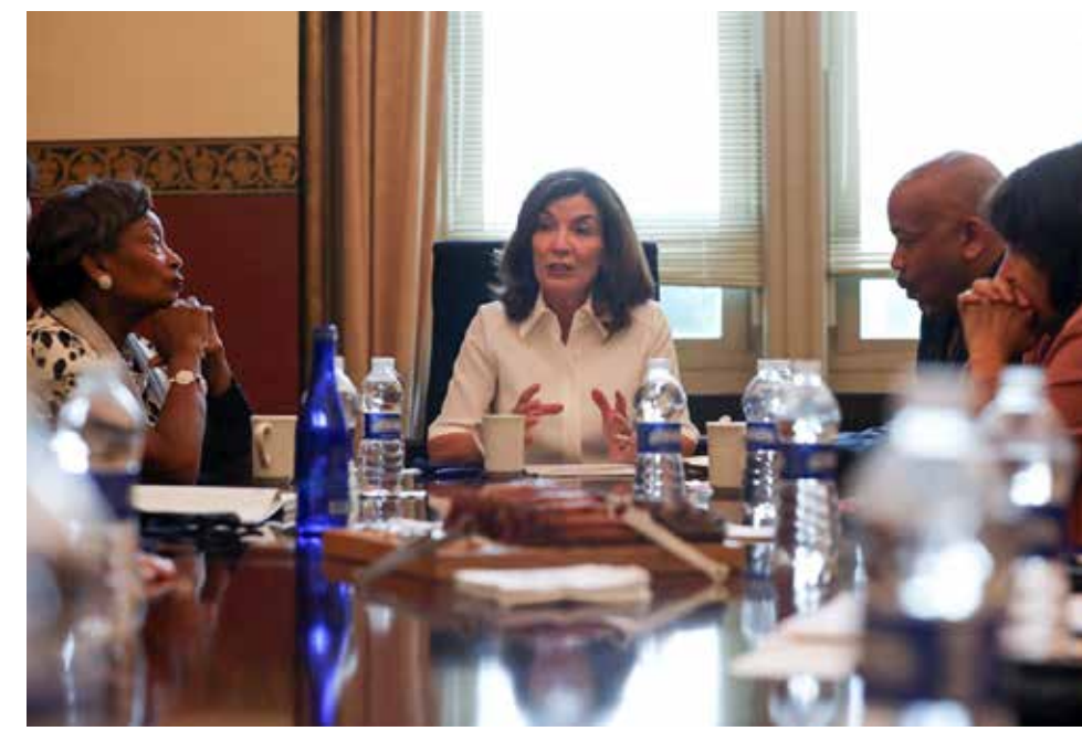
Governor Kathy Hochul, with Statte Senate Majority Leader Andrea Stewart-Cousins and Assembly Speaker Carl Heastie

On Aug. 24, her first day in office, Governor Kathy Hochul announced a new, comprehensive plan to help ensure a safe, productive return to schools this fall in the midst of rising COVID-19 numbers fueled by the Delta variant. As part of this plan, Governor Hochul has directed the New York State Department of Health to institute a universal mask requirement in all schools, public and private, as determined necessary at the discretion of the Commissioner. The Department of Health will issue the requirement through regulatory action established by the Public Health and Health Planning Council.