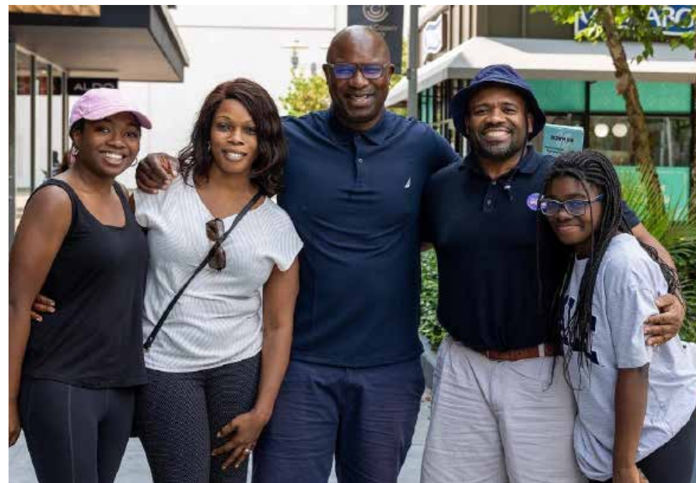
Congressman Jamaal Bowman, center, easily won his democratic primary