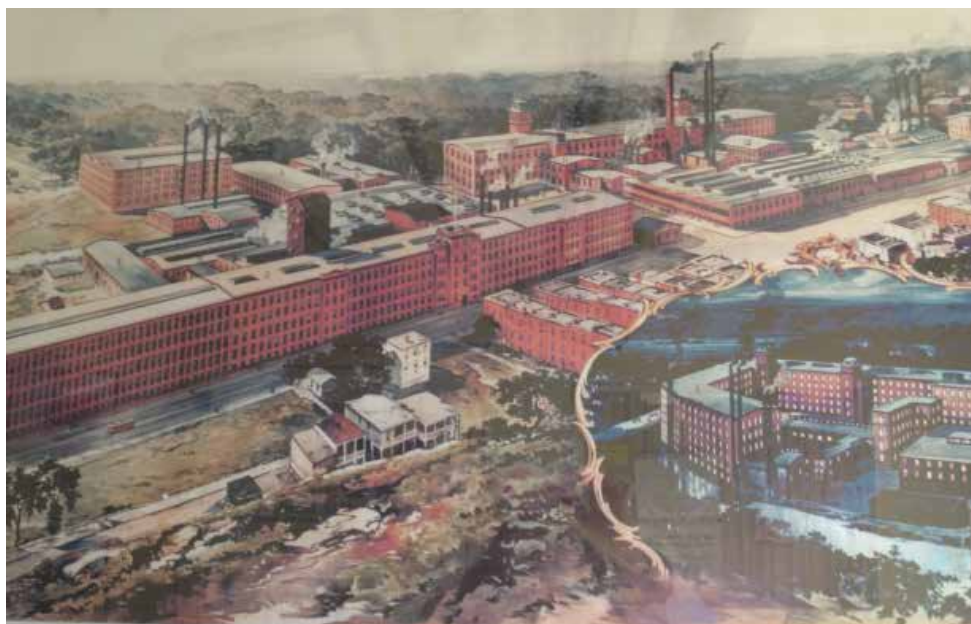
The Alexander Smith Mills Carpet Factory in Yonkers was so profitable, and their owners so generous, that employees received bonuses of 10% of the salary over 10 years, with bonuses totalling $82,000 in 1923!