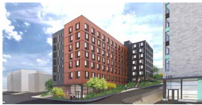
178 Warburton Avenue | Yonkers, NY 10701 | 914-821-1132 | TTY: 711 | www.theridgewaycommunities.com

178 Warburton at the Ridgeway is a vibrant apartment community steps from downtown, Yonkers, NY!