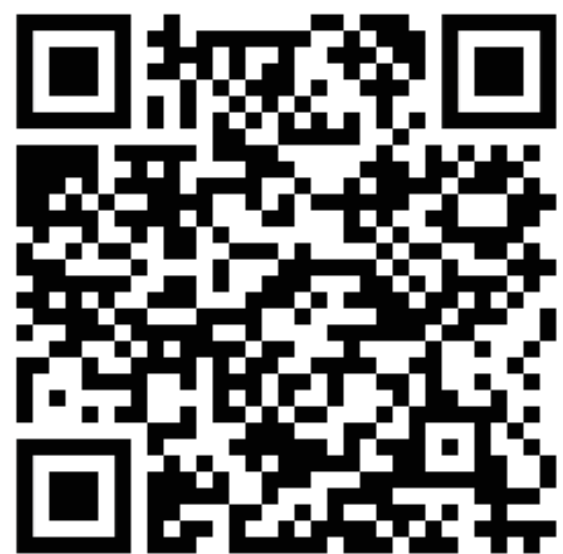
Scan the QRC for access to our website.