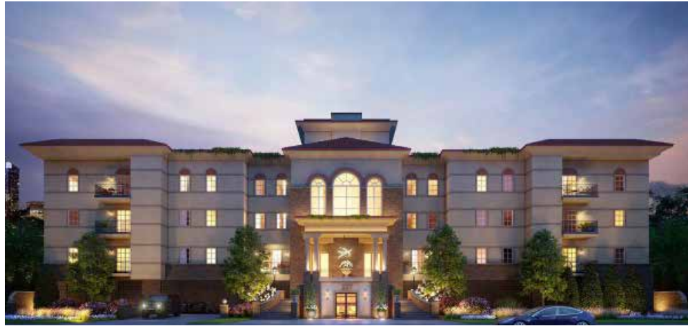
the quick sale of condos at The Centrale in White Plains, points to Westchester's booming housing market