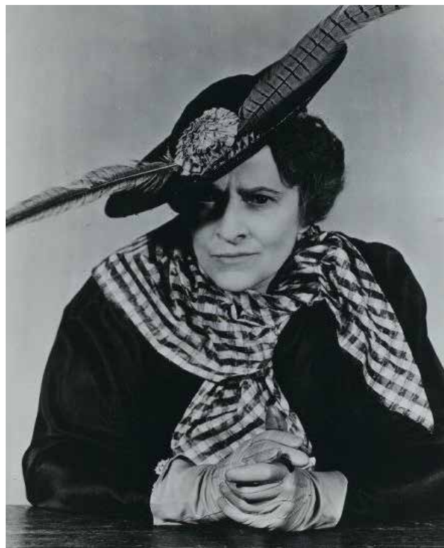
actress Ruth Draper, left, appeared at one of the many classic theaters in Yonkers in the 1930's