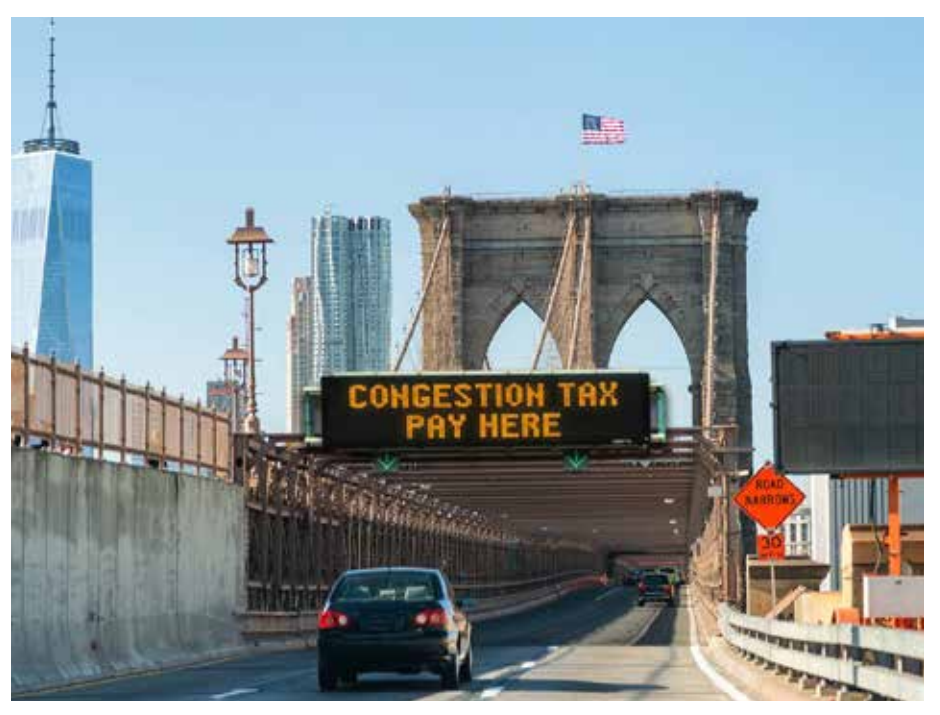
Funds Raised to be used for Class Action Suit to Stop It!

Unyielding opponents of New York's regressive Congestion Pricing Tax are imploring New Yorkers to donate $15 each to support a class action lawsuit seeking to halt the tax in its tracks, the group Keep NYC Congestion Tax Free today announced. A $15 donation would be the same amount as a single car trip below 60th Street in Manhattan, once Congestion Pricing begins.