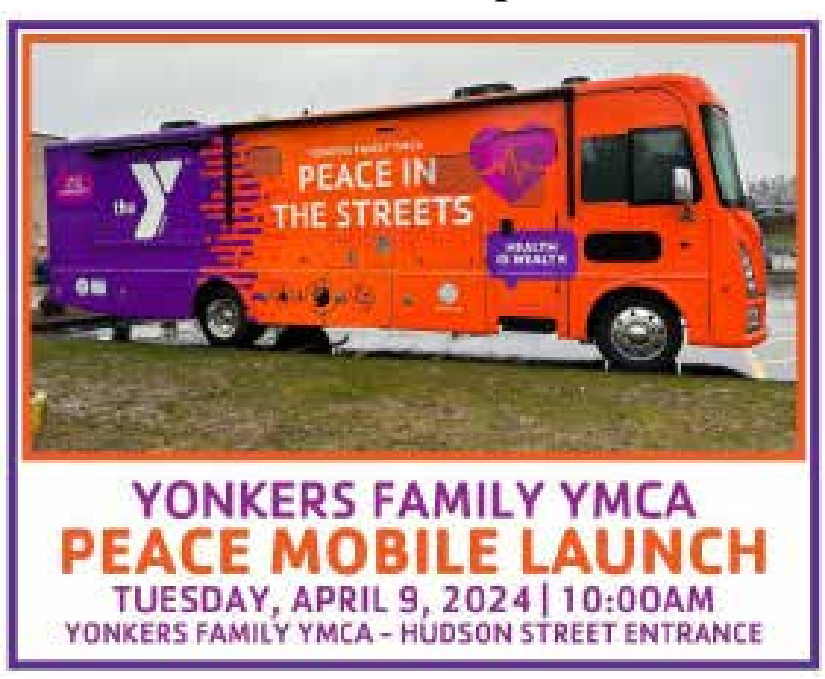
Yonkers Family YMCA Peace Mobile Set to Launch April 9