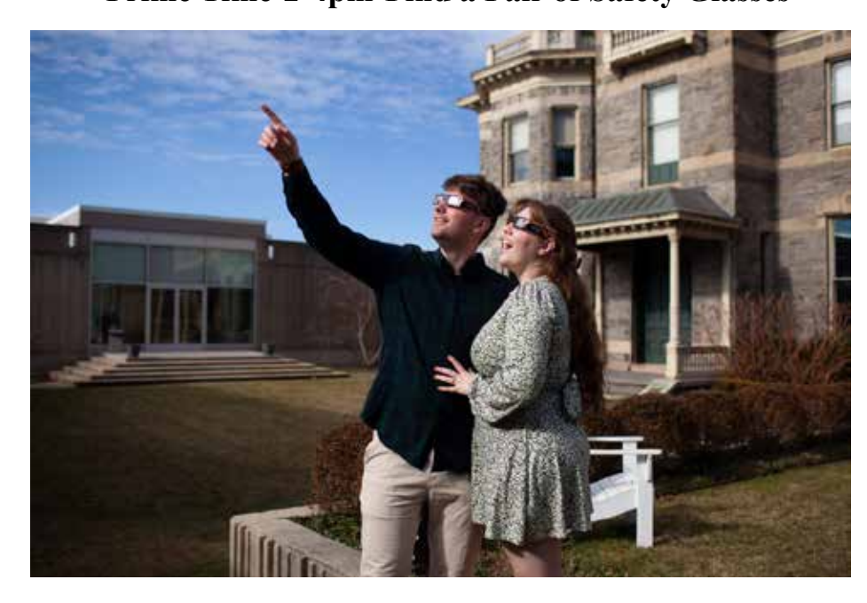
The Hudson River Museum's Eclipse Watch on April 8 is sold out

Prime Time-2-4pm-Find a Pair of Safety Glasses