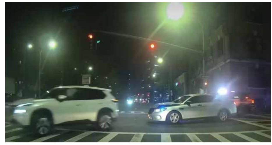
Yonkers Police chase a stolen car

Just after 9:45 PM on March 14, 2024, Yonkers Police Department officers were approached by a victim in the area of McLean Avenue and Van Cortlandt Park Avenue who related that his vehicle had just been stolen moments earlier nearby.