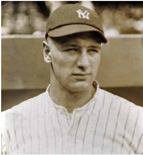
Lou Gehrig visited Yonkers Boys Week in 1928