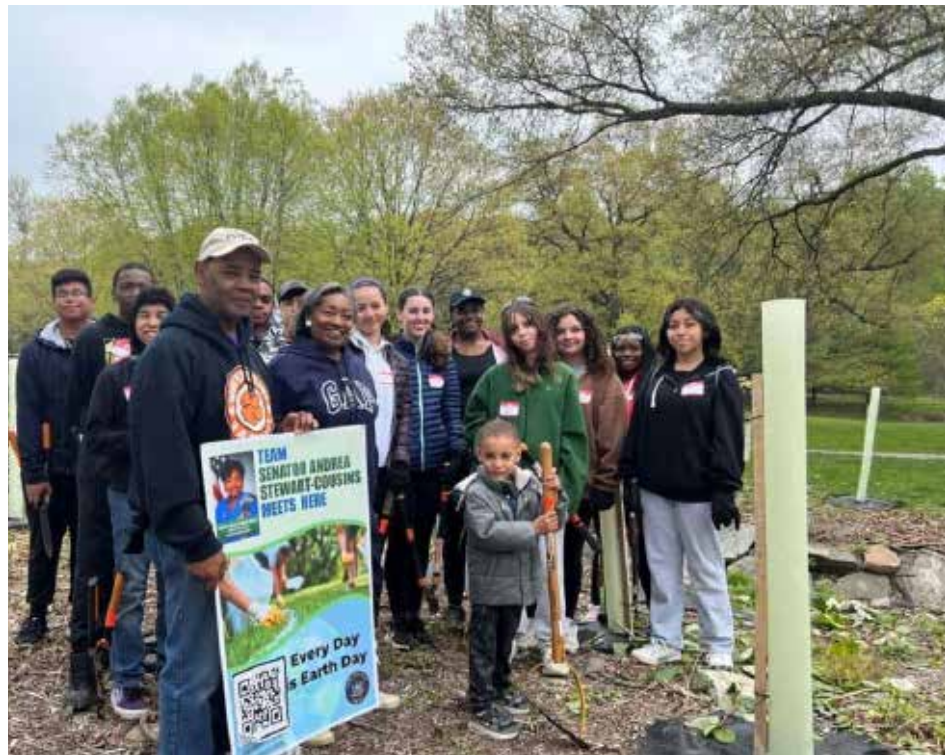
Sixteen members of Senator Andrea Stewart-Cousins' Youth Advisory Council (YAC) joined her as she sponsored an Earth Week cleanup on Saturday, April 22 at Tibbets Brook Park in Yonkers. For the third straight year, the Senator sponsored Westchester County's Pitch in for Parks program leading a YAC Pitch in team at Tibbets.

With Her Youth Advisory Council at Tibbets Brook Park