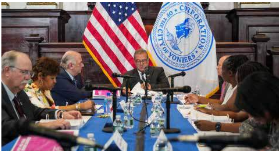
Mayor Mike Spano presents budget to the City Council