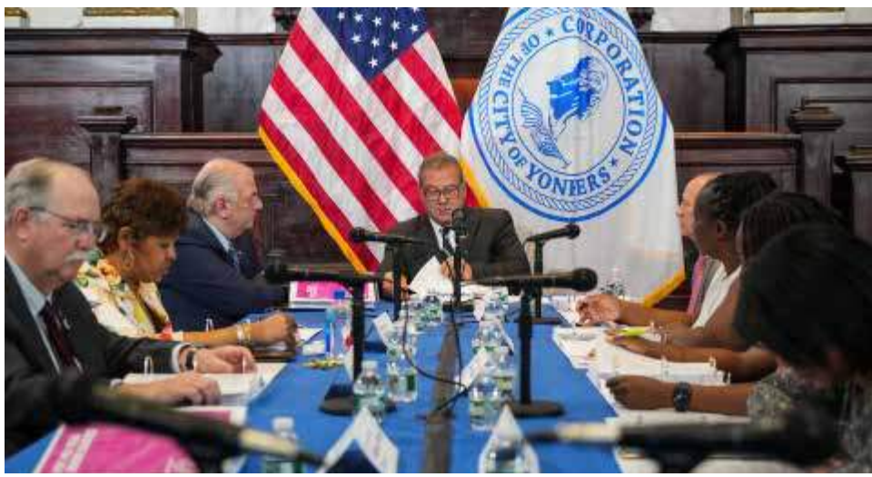
Mayor Mike Spano presents budget to the City Council