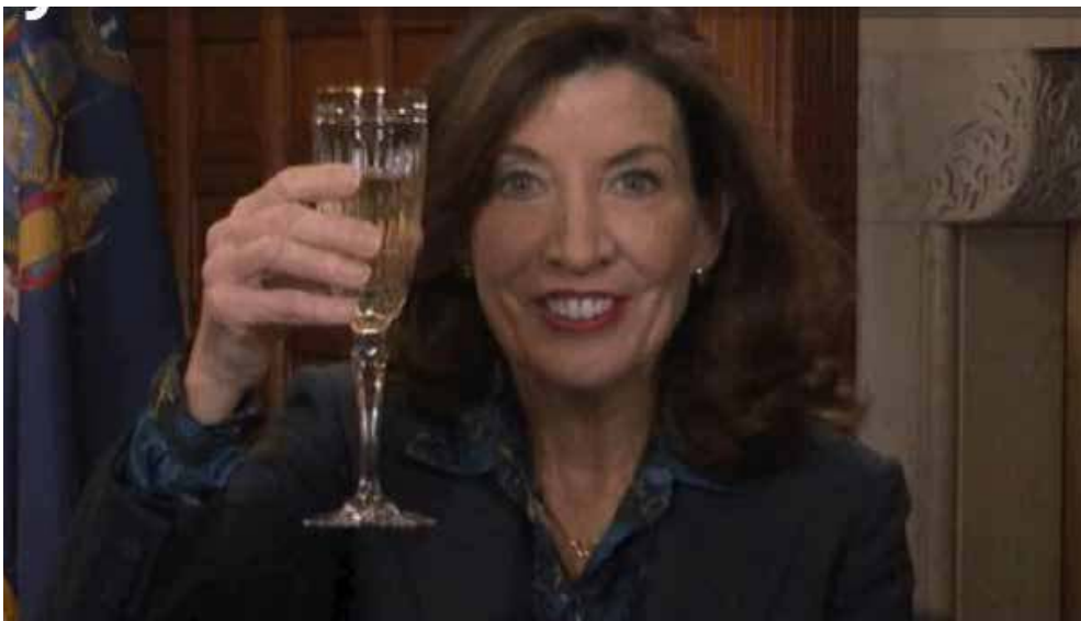
Gov. Kathy Hochul, celebrating "Drinks to go" in the NYS budget

On April 8, a $220 Billion New York State budget was agreed to by Governor Kathy Hochul, State Senate Majority Leader Andrea Stewart-Cousins and Assembly Speaker Carl Heastie. The budget, which was adopted one week late, calls for changes that Hochul wanted to bail and criminal justice reform, a 16 cent per gallon gas tax repeal, more funding for child care subsidies, $600 million for a new stadium for the Buffalo Bills, and three casino commercial licenses, one of which is believed to be for MGM Casino -Yonkers Raceway, which would allow full scale gaming and a sports book.