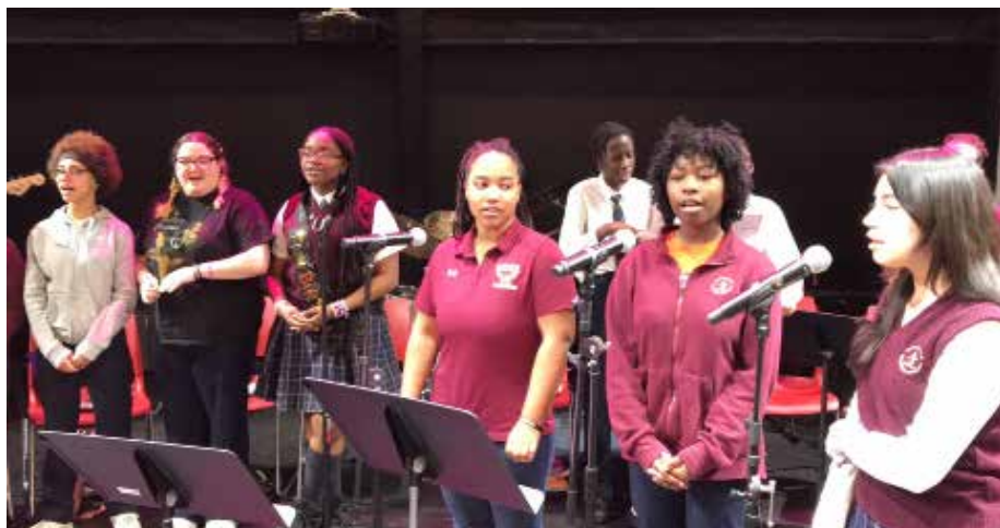
CSEE High School students rehearsing for Godspell

Students at the Charter School of Educational Excellence (CSEE) will perform the high school's first musical—Godspell—on May 3 and 4.