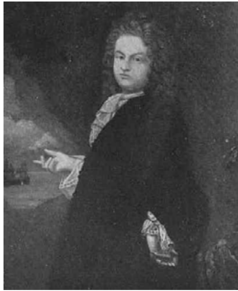
Frederick Philipse, first lord of Philipsburg Manor