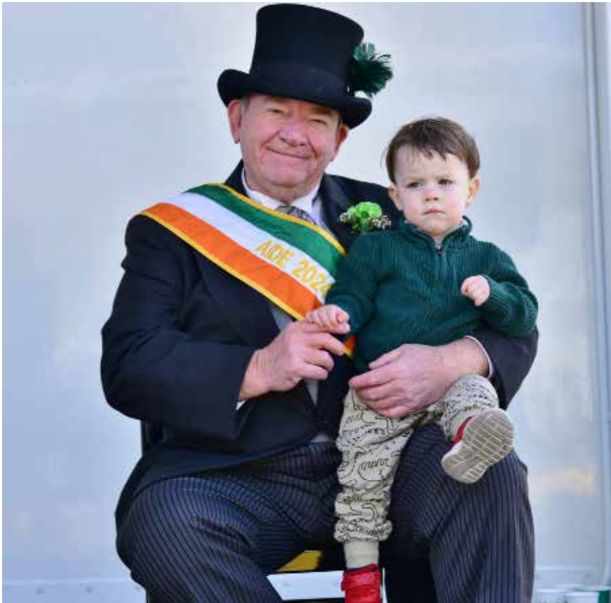
Generations of Irish Americans enjoy the parade