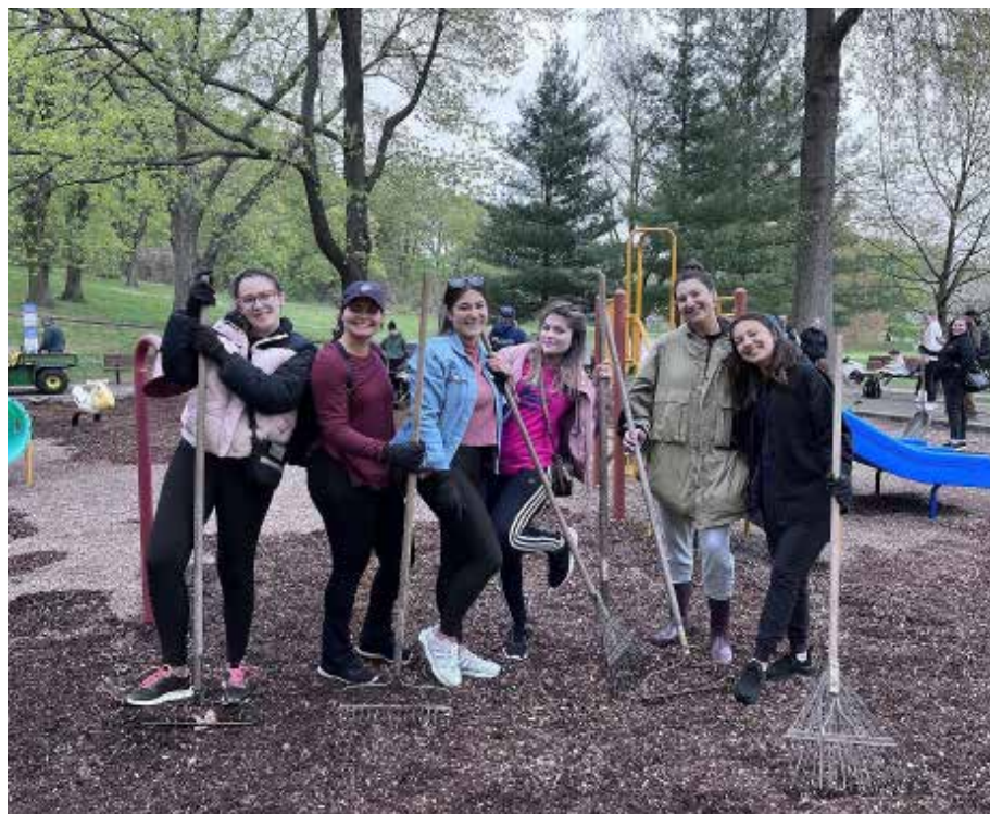
Record Breaking 1,000+ Volunteers Expected in Earth Day Clean-Up Events

Westchester Parks Foundation is getting ready for its largest volunteer event of the year. Started in the late 90’s, Pitch in for Parks is the largest multi-day volunteer event that helps get parks ready for peak season. The event kicks off April 18 and culminates on Earth Day April 22. Park stewards will help with trash clean up, clearing trails and shorelines, restoring wildlife habitats, removing invasive vines from trees, painting, raking, and preparing and planting flower beds. Participating local businesses include returning Gold Sponsor, Triton International.