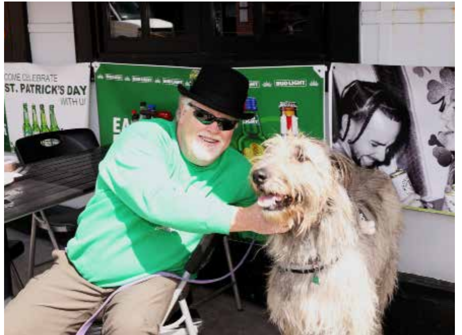
one of my favorite parts of the parade--the Irish Wolfhounds