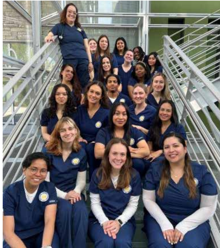
graduating students from WCC's two year nursing program

SUNY Westchester Community College celebrated its Nurse Pinning Ceremony in which 19 students completed their nursing studies and received their SUNY WCC nursing pins. May has been designated National Nurses Month, and May 8 is National Student Nurse Day. This year's nursing students completed the two-year Nursing A.A.S. Program, which is designed to prepare students for careers as Registered Nurses. Graduates of the program can transfer almost anywhere, in-state or out-of-state. New York State residents are also guaranteed admission to a SUNY four-year campus. "Our nursing graduates will soon be serving our community in this noble profession. As was evident during the recent pandemic, the U.S. has a critical shortage of registered nurses, a shortage that might top 1 million by the end of this decade. In response to this shortage, SUNY WCC expanded its nursing program in January 2024 to provide more students with the training and education they need to help fill this need."