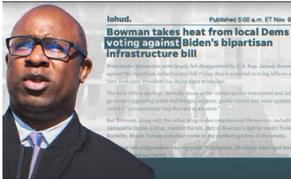
Above: TV ad highlights Bowman's No Vote on President Biden's infrastructure bill; Below protestors outside of Latimer fundraiser in Armonk

Multi- Million Ad Campaign for Latimer-Bowman Race for Congress Begins Bowman Continues to Play the MAGA Card against Latimer New Ad Highlights Bowman NO Votes on Infrastructure Bill