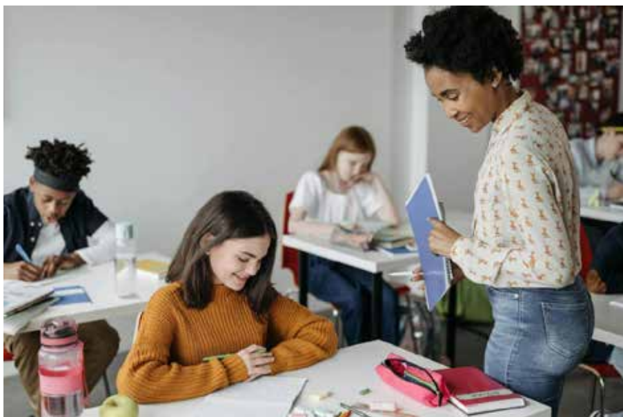
Pushback from New Rochelle School Board & Teachers Union. Same Old Argument Against School Choice