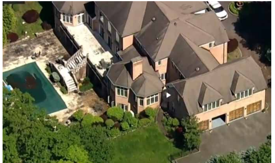
above: drone photo of 14 Hallock Place left: social media photo of Joseph Spennato