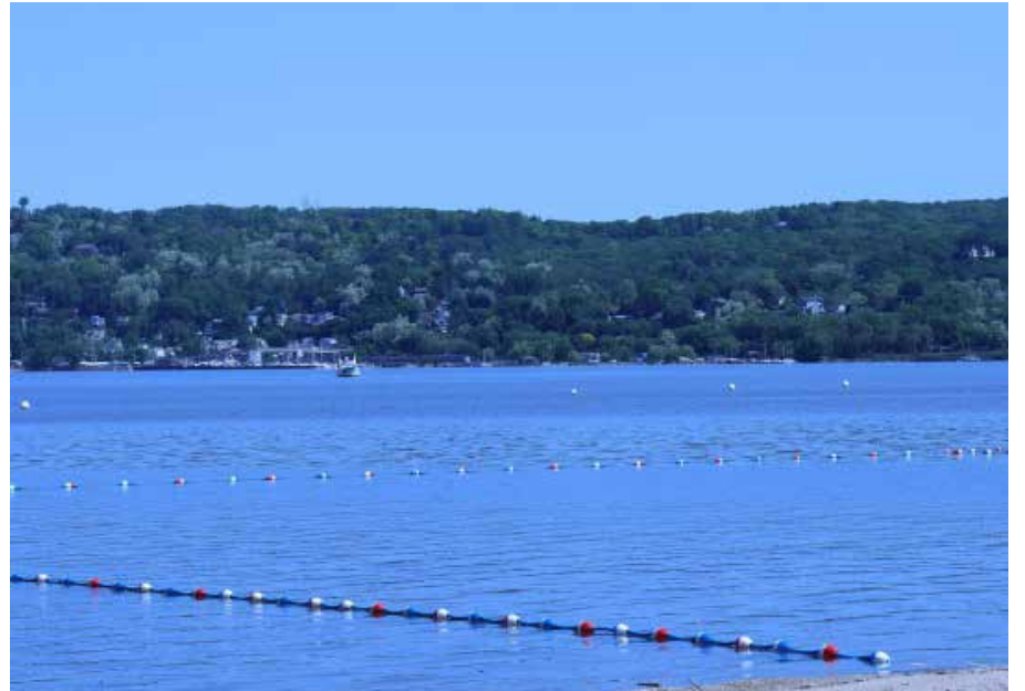
POOLS TO OPEN FRIDAY, JUNE 28

Put on your bathing suits, grab your sunscreen and head to the beach Memorial Day Weekend as Croton Point Beach in Croton-on-Hudson and Glen Island Beach in New Rochelle will open on a pre-season basis, Saturday, Sunday and Monday, May 25, 26 and 27, weather permitting.