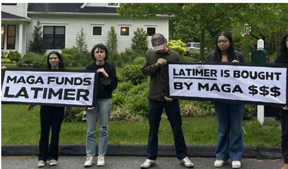
See story on pg 15-