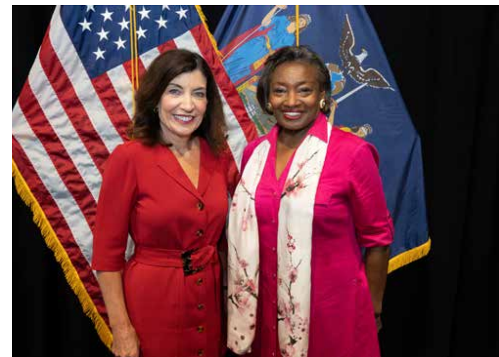
Governor Kathy Hochul, with State Senate Majority Leader Andrea Stewart-Cousins

On August 8, New York Governor Kathy Hochul signed a package of bills into law that address housing affordability for senior homeowners and first-time homebuyers.