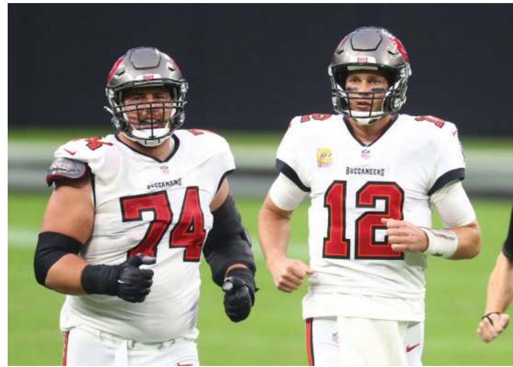
The Big Game Won't Be Over Until 10:30 pm

Yonkers State Assemblyman Nader Sayegh is calling on New York Governor Andrew Cuomo to extend Super Bowl Sunday restaurant and all applicable venues IE. bars and lounges etc. closings from 10 pm until midnight. By Executive Order, New York's COVID-19 restrictions require restaurants and all applicable venues to end in person dining and alcohol service at 10 p.m.