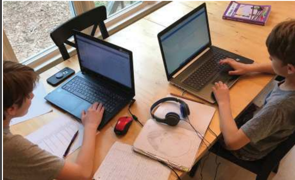
Some families with more than one student don't have enough devices