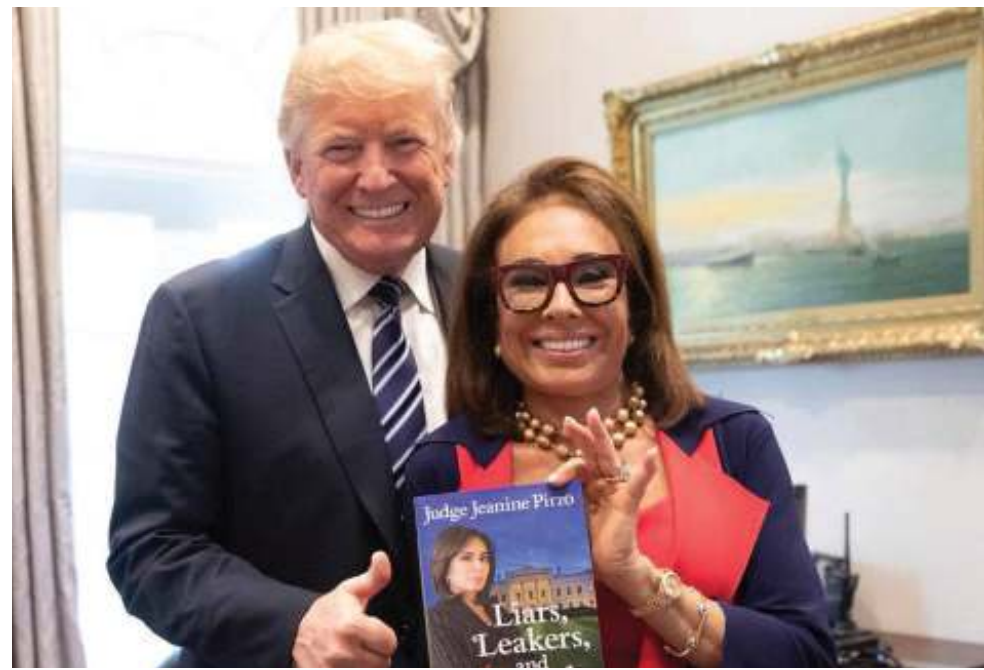
Jeanine Pirro with former President Donald Trump