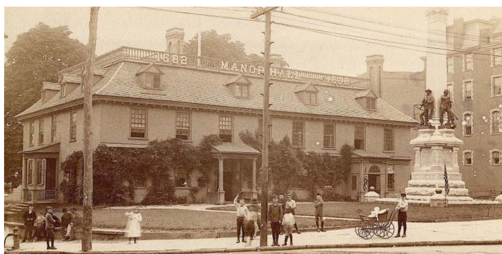
Philipse Manor Hall, the oldest building in Yonkers