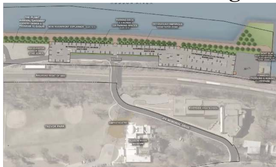
Rendering of proposed parking plan at JFK Marina Park