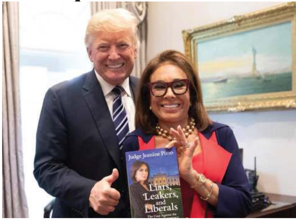
Jeanine Pirro, with former President Trump at The White House