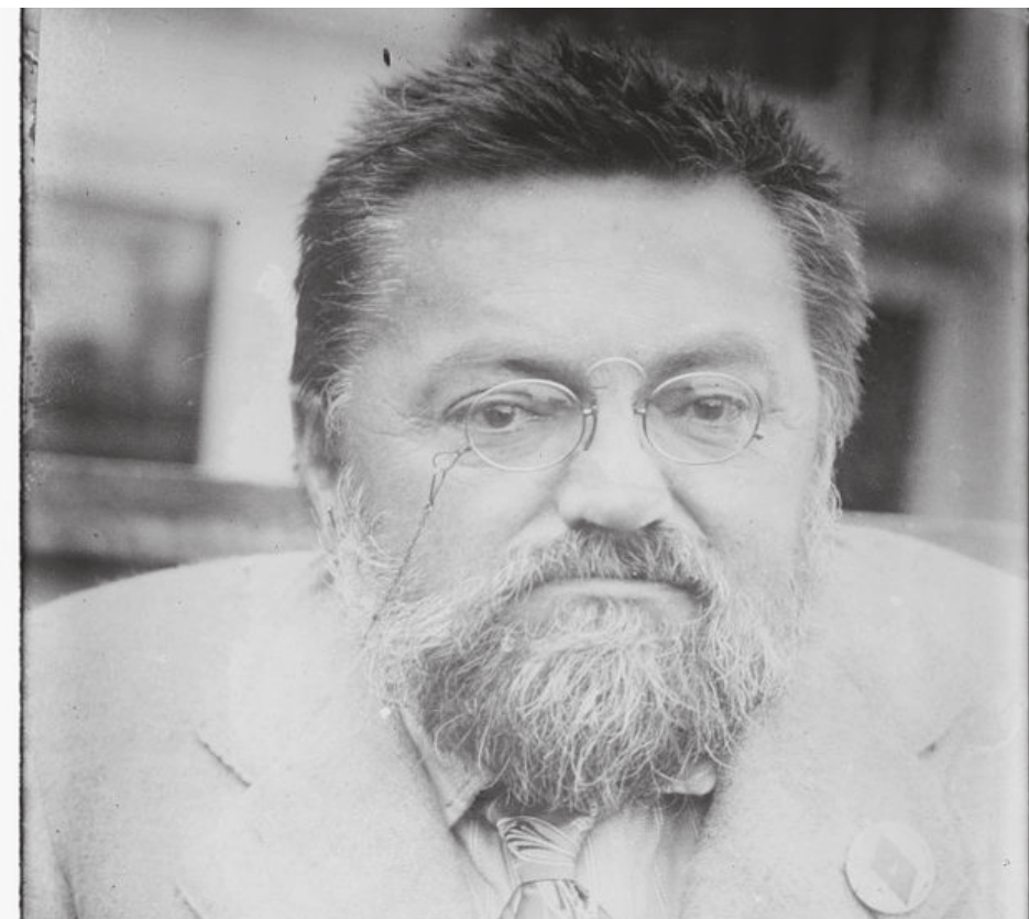
Yonkers resident Charles Steinmetz, the greatest electrical engineer of his time