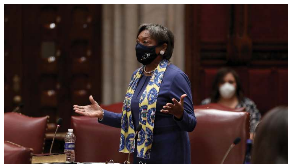
State Senate Majority Leader Andrea Stewart-Cousins, from Yonkers