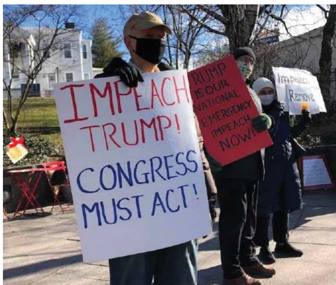
Concerned Families of Westchester protest in Hastings

Support for Trump’s removal was evident in Hastings, as members of Concerned Families of Westchester held a “Trump Must Go Now! Impeach! 25th Amendment! Resign!” rally on January 9.