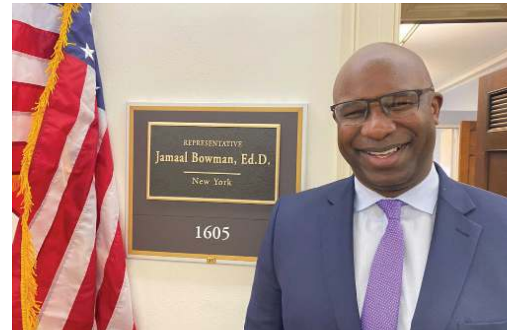
Yonkers new Congressman, Rep. Jamaal Bowman, outside his DC office