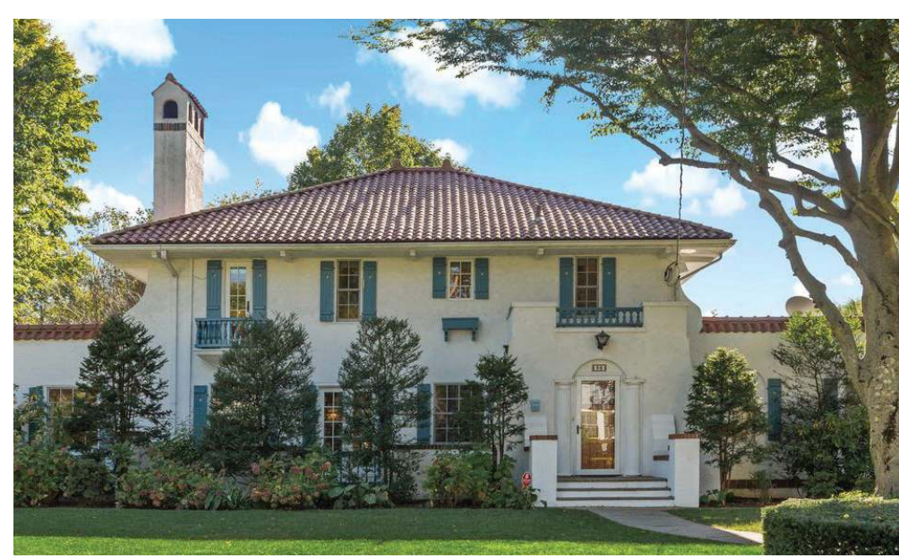
30 Cohawney Road, Scarsdale home listed at $2,495,000.

In 2020, the real estate market in Westchester, Putnam, and Dutchess Counties experienced a surge in sales directly related to the COVID-19 epidemic. Almost unilaterally, the volume of overall unit sales, as well as median sale prices rose, according to the Houlihan Lawrence Westchester Putnam & Dutchess Market Report released today.