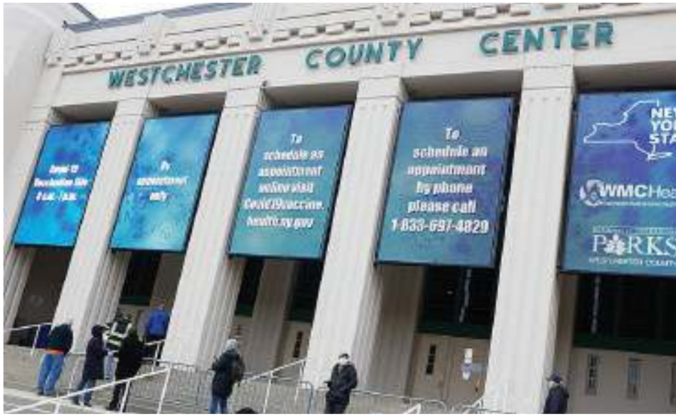
The County Center in White Plains, Westchester's first COVID Vaccination Site