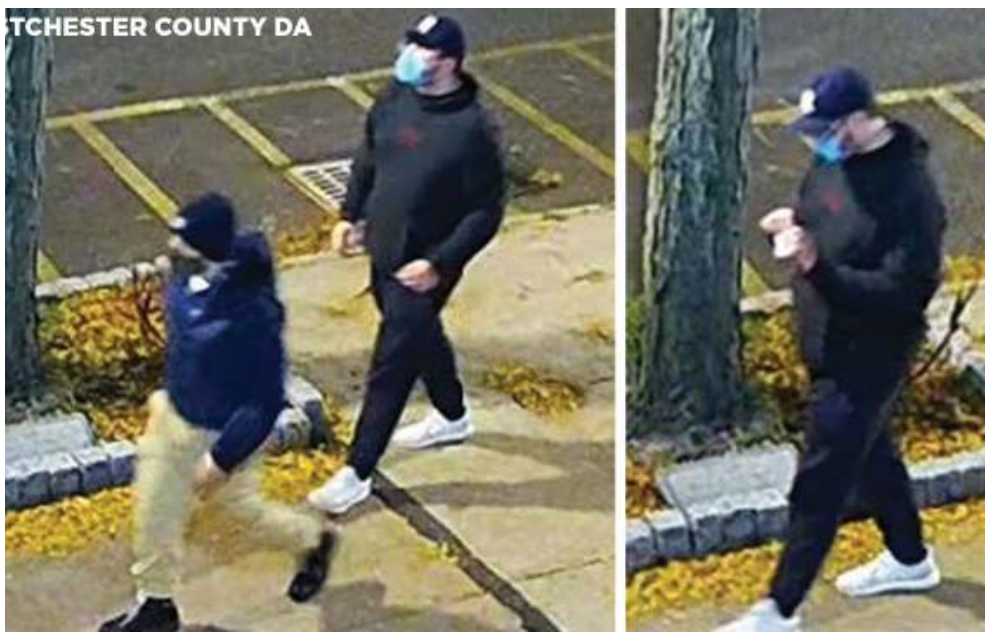
Suspects wanted for white supremacist stickers placed in Sleepy Hollow