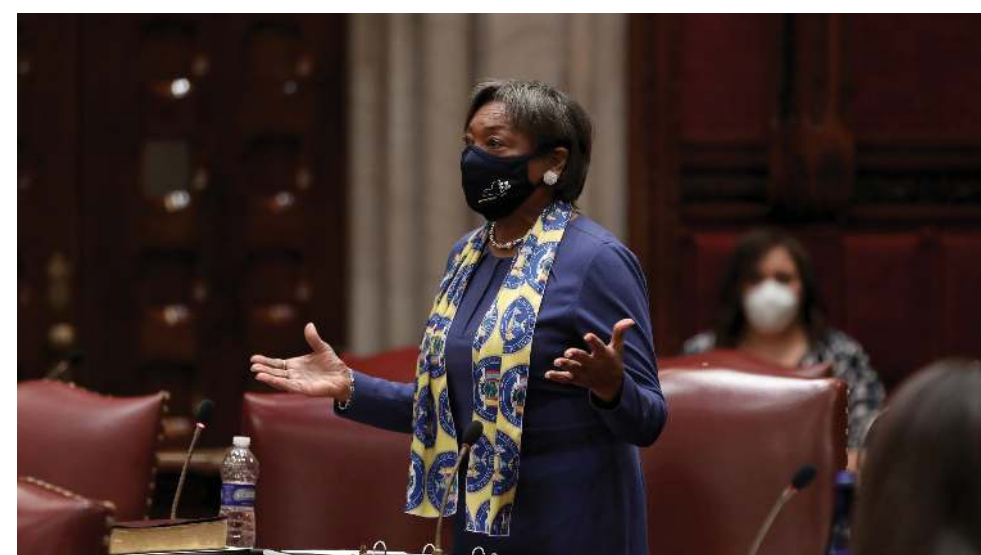
State Senate Majority Leader Andrea Stewart-Cousins, from Westchester