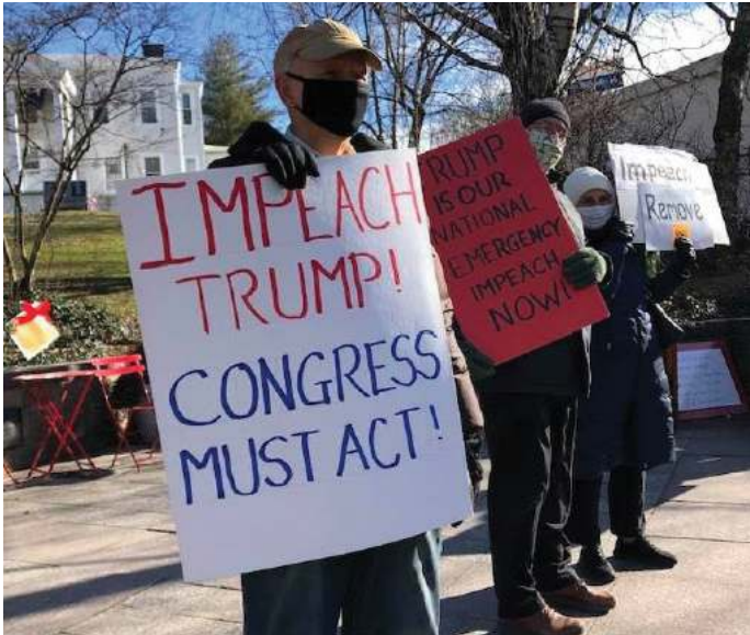
Concerned Families of Westchester rally in Hastings last week