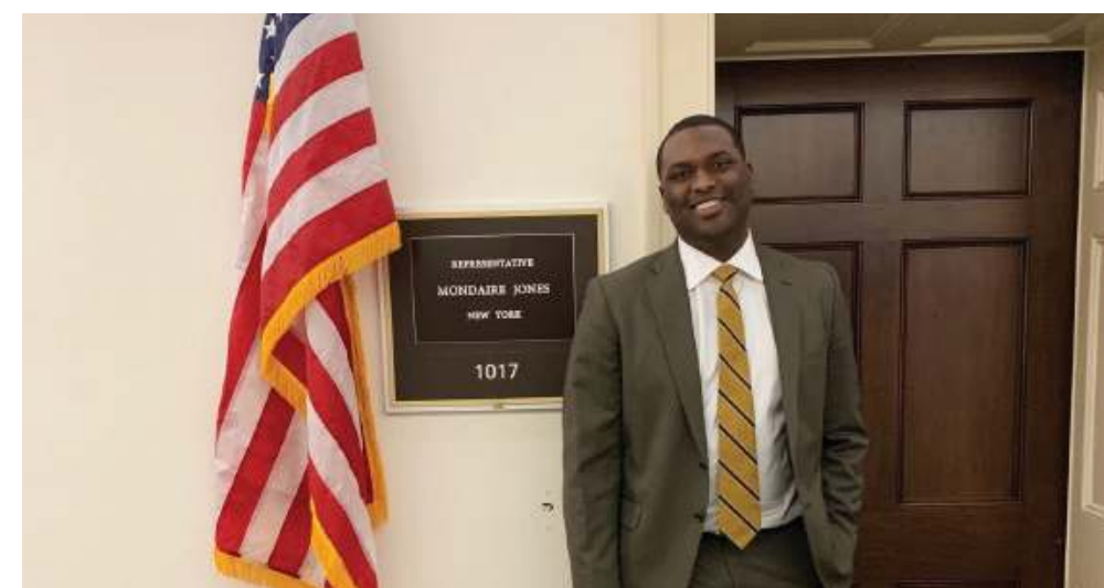
Rep. Mondaire Jones, outside of his Capitol office in Washington DC

duct, warrants impeachment and trial, removal from office, and disqualification to hold and enjoy any office of honor, trust, or profit under the United States.”