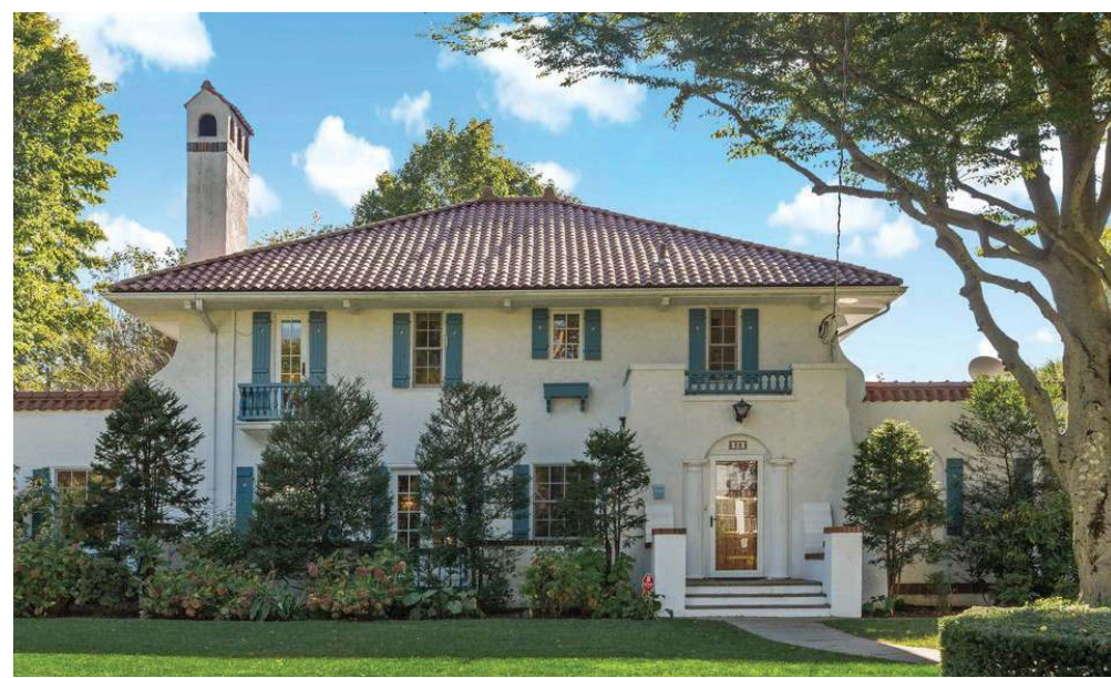
30 Cohawney Road, Scarsdale home listed at $2,495,000.

In 2020, the real estate market in Westchester, Putnam, and Dutchess Counties experienced a surge in sales directly related to the COVID-19 epidemic. Almost unilaterally, the volume of overall unit sales, as well as median sale prices rose, according to the Houlihan Lawrence Westchester Putnam & Dutchess Market Report released today.