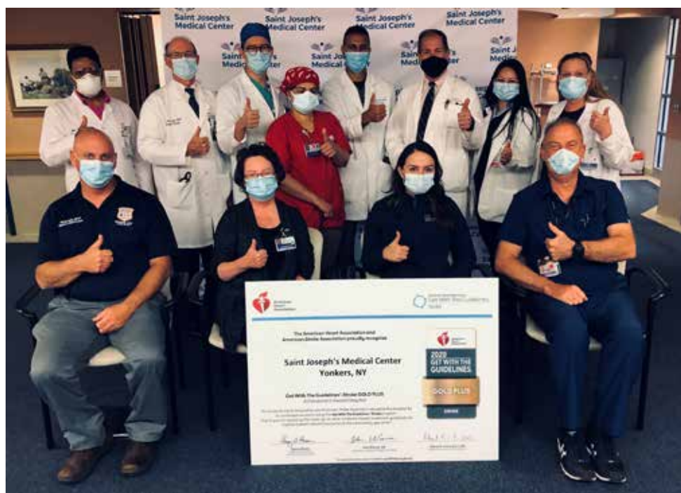
St. Joseph's Medical Center staff with their AMA Award

Saint Joseph's Medical Center recently received the American Heart Association/American Stroke Association's Get With The Guidelines®-Stroke Gold Plus Quality Achievement Award. The award recognizes the hospital's commitment to ensuring stroke patients receive the most appropriate treatment according to nationally recognized, research-based guidelines based on the latest scientific evidence.