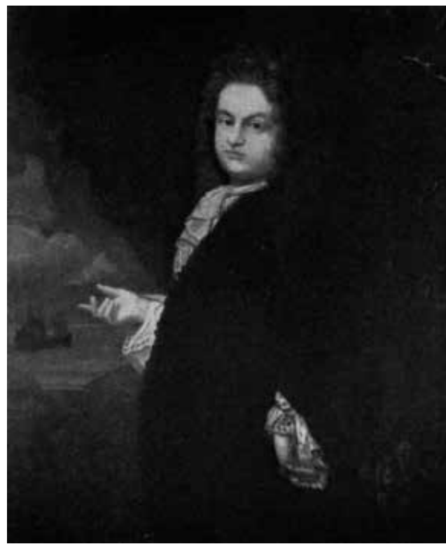
Frederick Phillipse purchased parts of the Yonkers downtown from the Van der Donck family in 1672