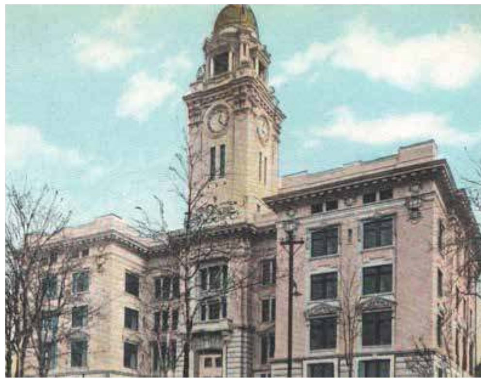
Yonkers City Hall

Senate Majority Leader Andrea Stewart-Cousins and Assemblyman Nader Sayegh are both running unopposed on Nov. 3. Both are serving Yonkers in Albany with results, and we look forward to their continued public service.