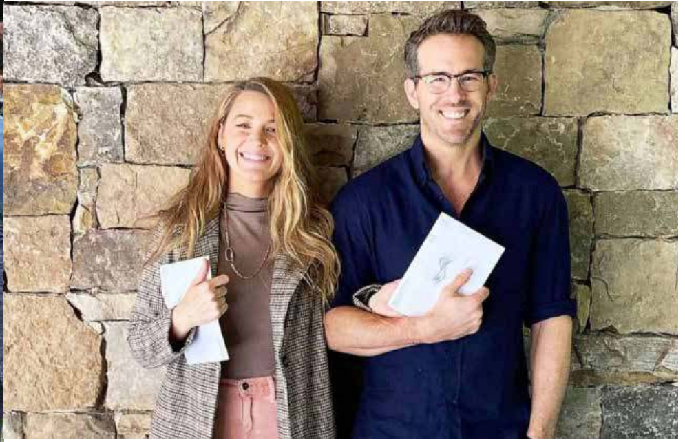
Westchester voters Blake Lively and Ryan Reynolds, right, voted by absentee ballot above, while long lines for early voting in Yonkers had some bringing a chair along for the 2 hour wait.