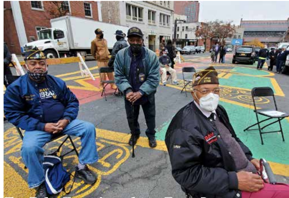
Three Yonkers Veterans in attendance at Veterans Day ceremony on South Broadway, next to BLM Mural.