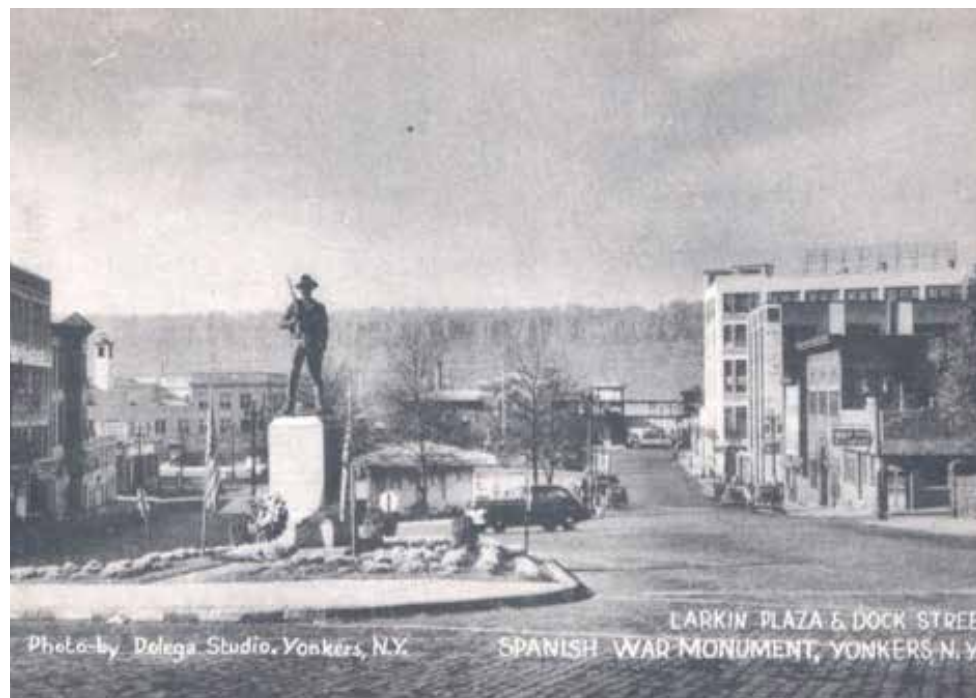
An early postcard of Larkin Plaza Park