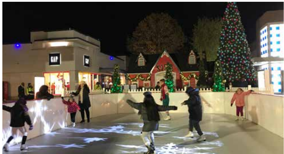
Pop up skating rink coming to Cross County Center