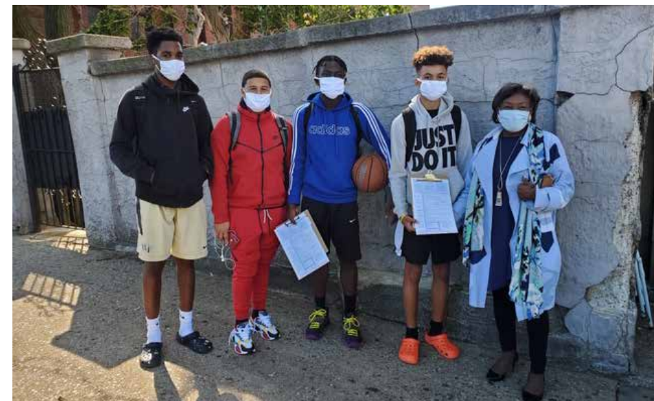
The Westchester Black Women's Political Caucus-Yonkers Chapter conducted a Voter Registration and Education pop up event on Saturday, October 3, 2020. The event was held at three locations- Mulford Gardens, YWCA and Shoprite- Greenway Plaza.