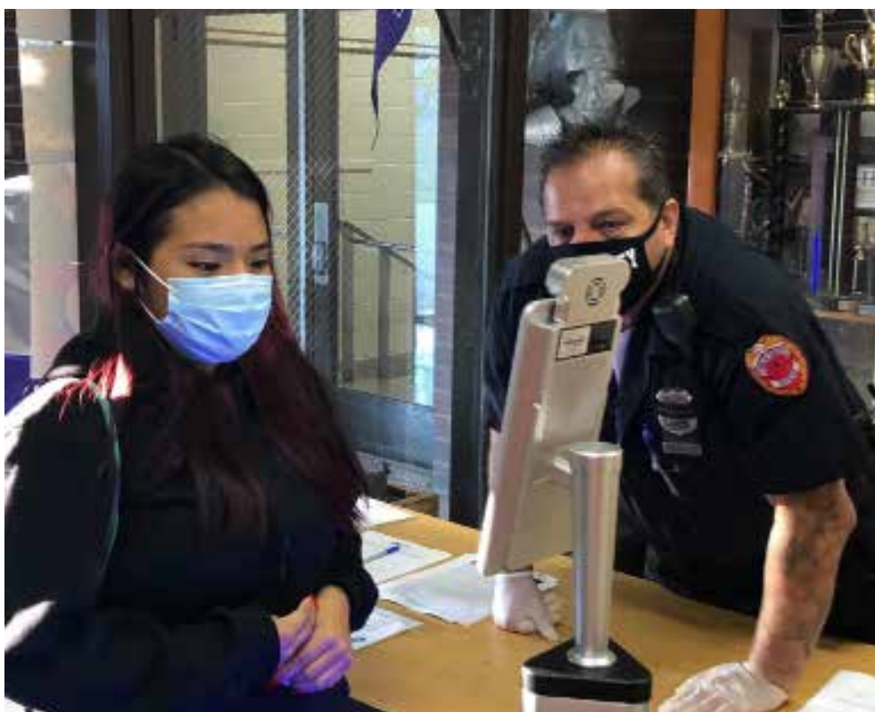
A student returns to Lincoln High School and has her temperature taken