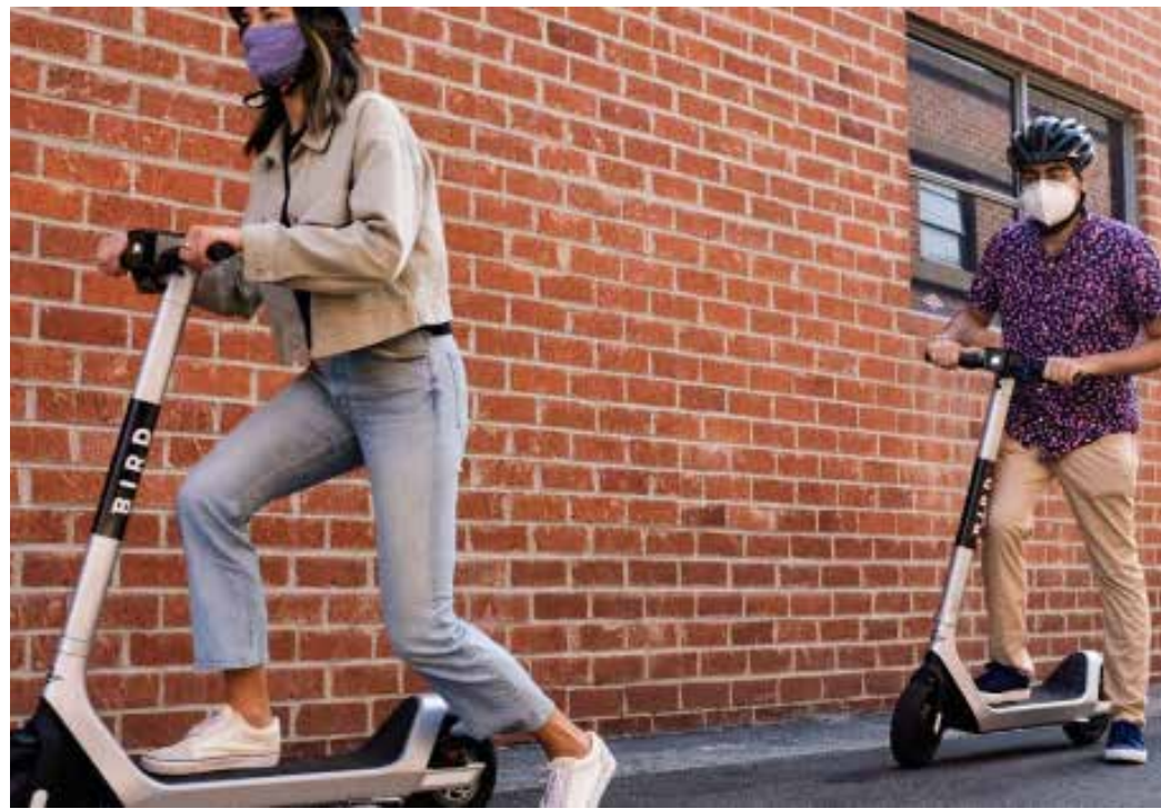
Bird Scooters are enjoyed in Yonkers