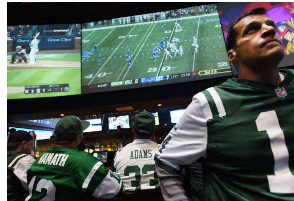
For another year, Westchester residents will have to travel for hours to make a legal bet on football