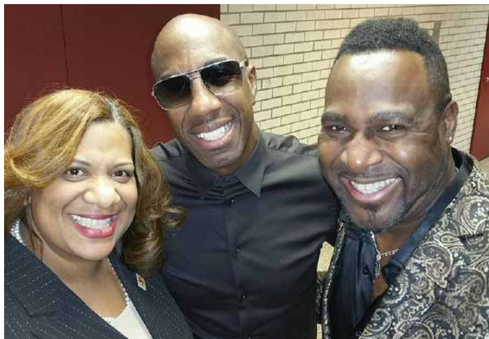
Actor and Comedian JB Smooth a Mount Vernon native, urged the residents of his hometown to fill out their Census as the October 31st deadline fast approaches. The City of Mount Vernon currently stands at 57.0% self-reporting which is 1% higher than the 2010 Census numbers of 56.0%. The "Curb Your Enthusiasm" actor highlighted the importance of the Census and what it means for the community. According to the 2010 Census Mount Vernon has a population count of 68,000 residents, but is believed to be undercounted by 30%. Each individual that completes their census can equate to about $2,300 in Federal Aid annually. A 30% undercount could result in about $73 Million in federal aid that Mount Vernon will miss out on. JB, is pictured above center, with Mayor Shawyn Patterson-Howard, left and Fil Straughan.