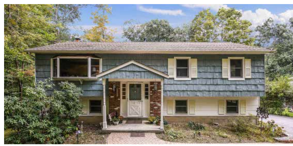
NYC buyers are increasing sales prices like this Yorktown home

Across Westchester, Putnam and Dutchess counties, the coronavirus has escalated buyer demand to an unparalleled degree, causing a substantial increase in the number of pending sales in the third quarter, a year-over-year rise in median sale prices for the quarter and an across-the-board dip in the number of listings.