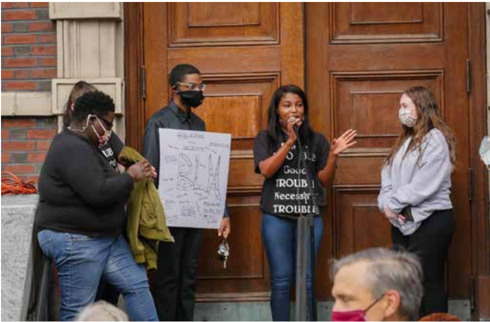
A BLM rally in Irvington