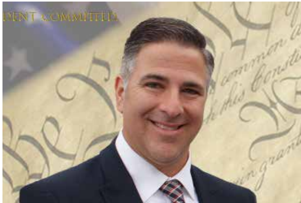
We Endorse Scott Smith for Congress in the 18th District

For months attendees from these rallies have shouted ‘blue lives matter’ and ‘black lives matter’ across the county at one another, without either side disavowing the sentiment of the other. Still, the back the blue speakers insist that the Black Lives Matter movement does not stand for the same values as theirs, failing to acknowledge that they are both advocating for similar police reforms.