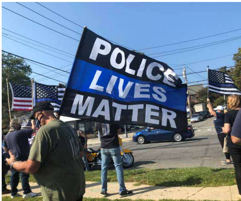
Back the Blue rally in Mamaroneck