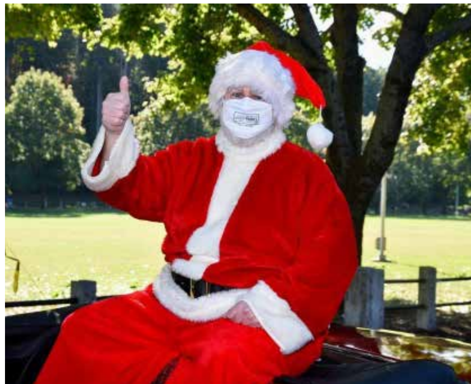
Santa at Kensico Dam Plaza on Oct. 14

The NEW Westchester's Winter Wonderland Drive-Thru Holiday Light Extravaganza, presented by Westchester Medical Center Health Network, kicks off Friday, November 27 at 6 p.m. at Kensico Dam Plaza in Valhalla. Westchester Parks Foundation, the only organization dedicated exclusively to promoting and supporting Westchester County Parks, has re-imagined the seventh season of the popular holiday event in partnership with the Westchester County Parks Department, to help create a safe and memorable holiday experience the whole family can enjoy. Guests will be dazzled and delighted with 1.2 miles of a holiday lights, larger than life displays, live characters, and Santa right from the warmth and safety of your own car!