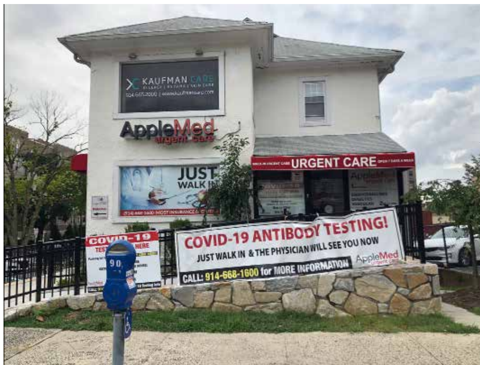
AppleMed Urgent Care in Mount Vernon