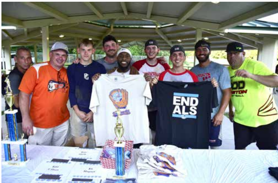
above, The Ice Buckets, winning Mens team. Below, the winning Co-Ed team, aptly named The Co-Ed Team.