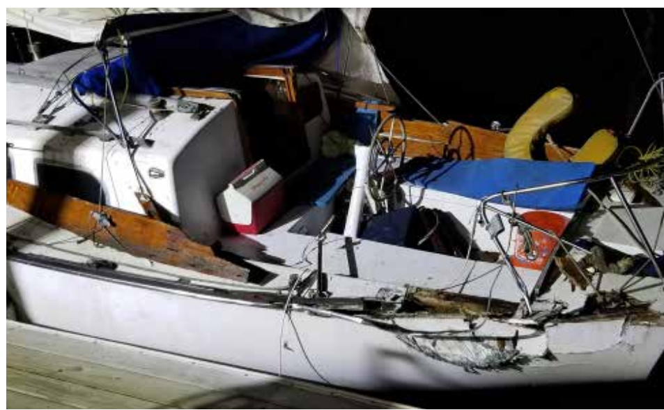
An intoxicated speedboat driver crashed into this sailboat on the Hudson River

The Westchester County Police Marine Unit charged an Ossining man with Boating While Intoxicated last month after the speedboat he was operating slammed into an anchored sailboat in the Hudson River.