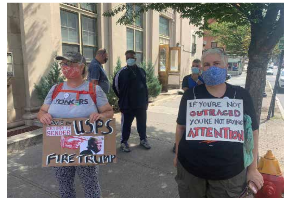
Save Our Post Office rally in Yonkers