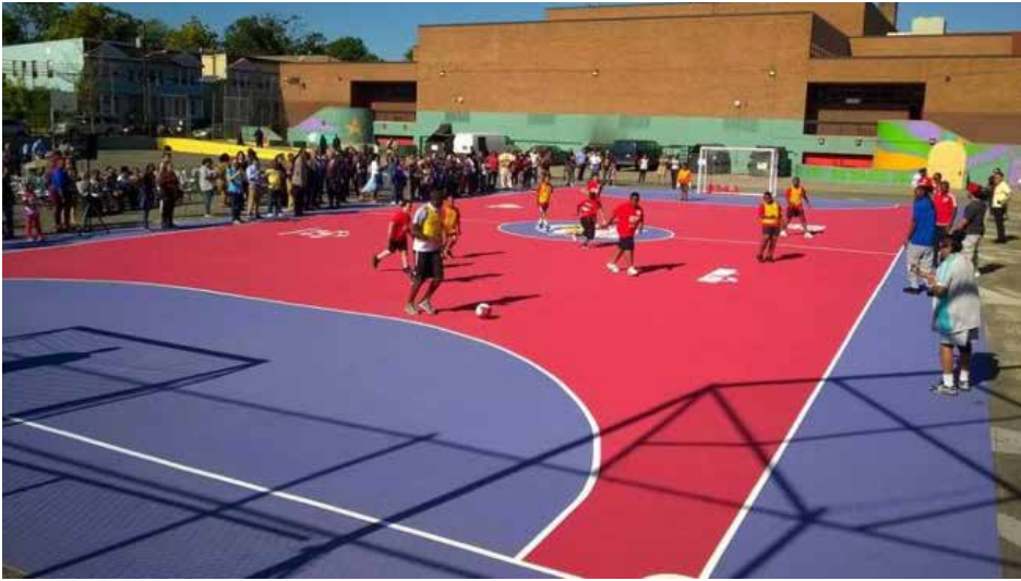
Stefanik Park, on Nepperhan Ave., will be getting a mini-soccer field like the one pictured above

Yonkers Mayor Mike Spano announced the City of Yonkers' partnership with the U.S. Soccer Foundation and Target to create the City's first mini-pitch (soccer field). The project is part of the U.S. Soccer Foundation's Safe Places To Play program, which seeks to transform underutilized areas, like vacant lots and empty schoolyards, into state-of-the-art pitches to play the game. Through its national partnership, Target and the U.S. Soccer Foundation will create 100 mini-pitches by the end of 2020. Yonkers' new mini-pitch will be located at Stefanik Park (Nepperhan Ave.) and will transform an empty pavement area into a mini-pitch to be used for recreational play.