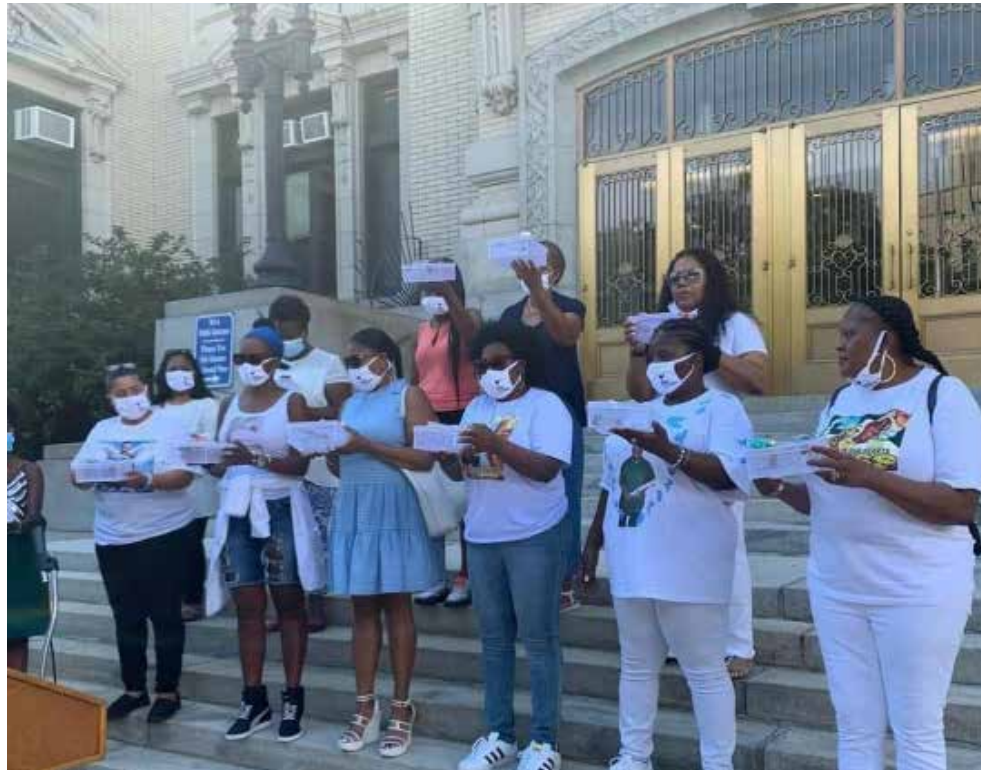
members of TheMothers2016 release butterflies to remember their loved ones