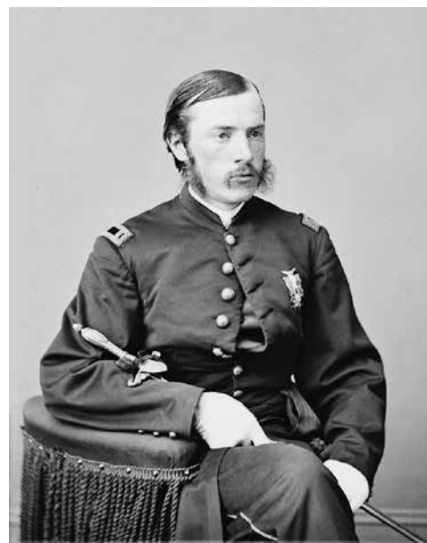
Dr. Charles A. Leale