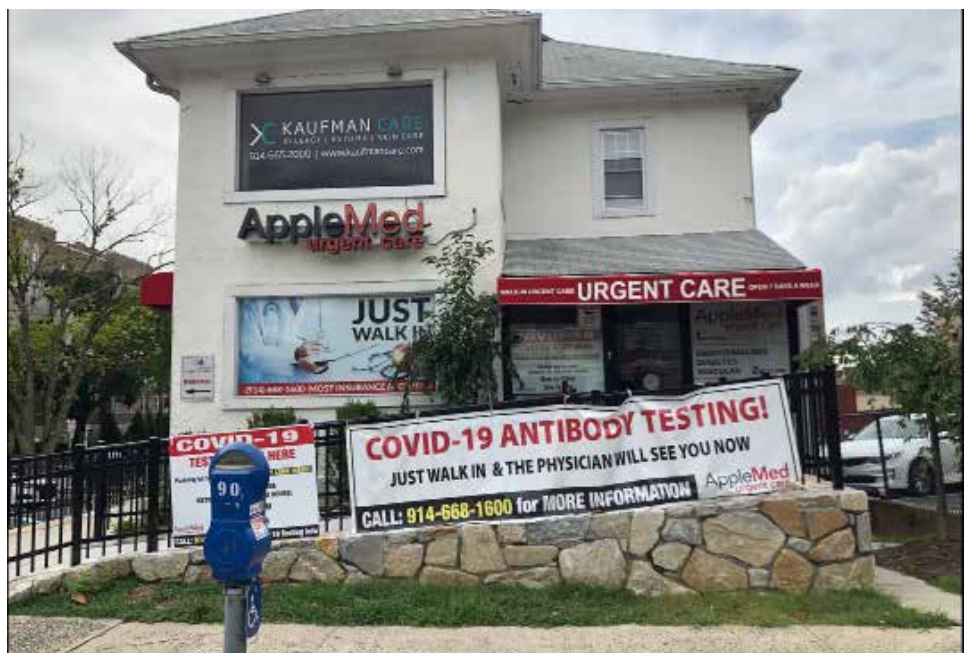
AppleMed Urgent Care in Mount Vernon