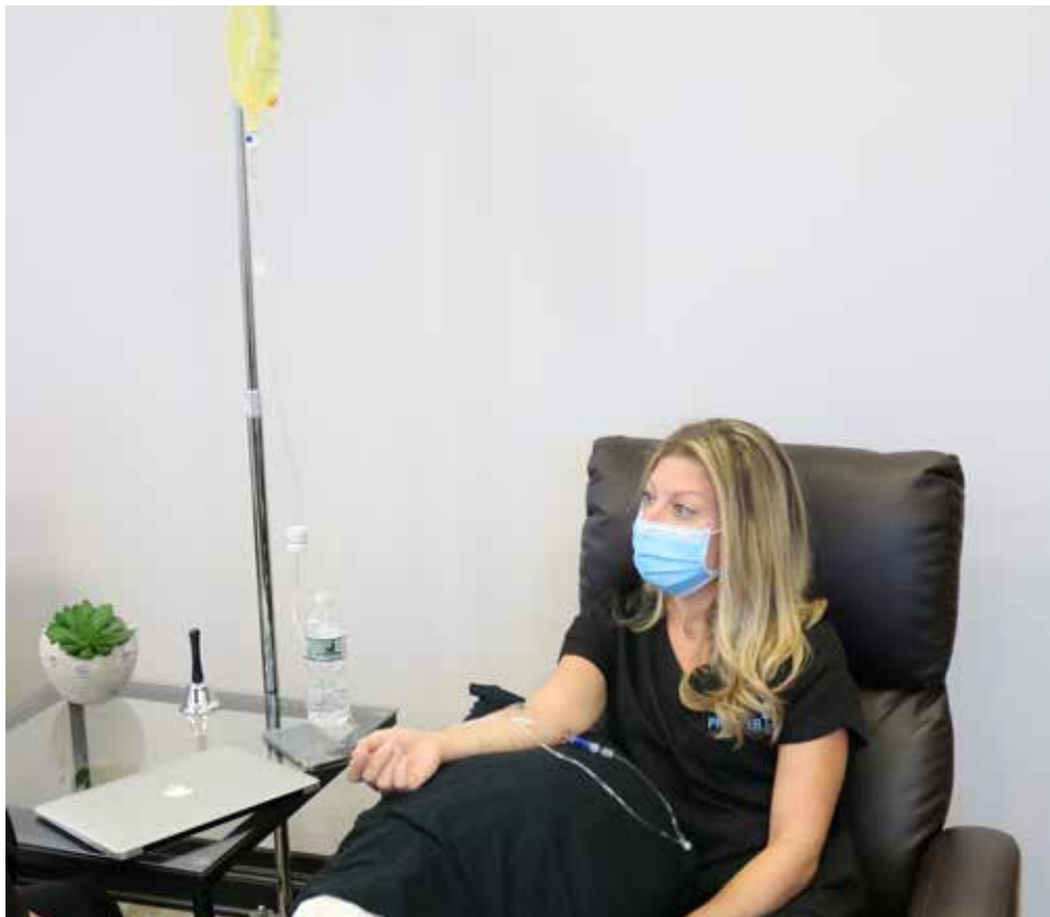
A patient receives an IV vitamin drip