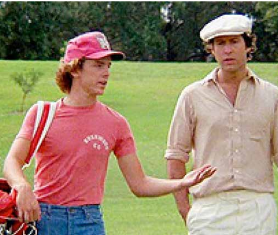
Larchmont native Michael O'Keefe, with Chevy Chase, in Caddyshack