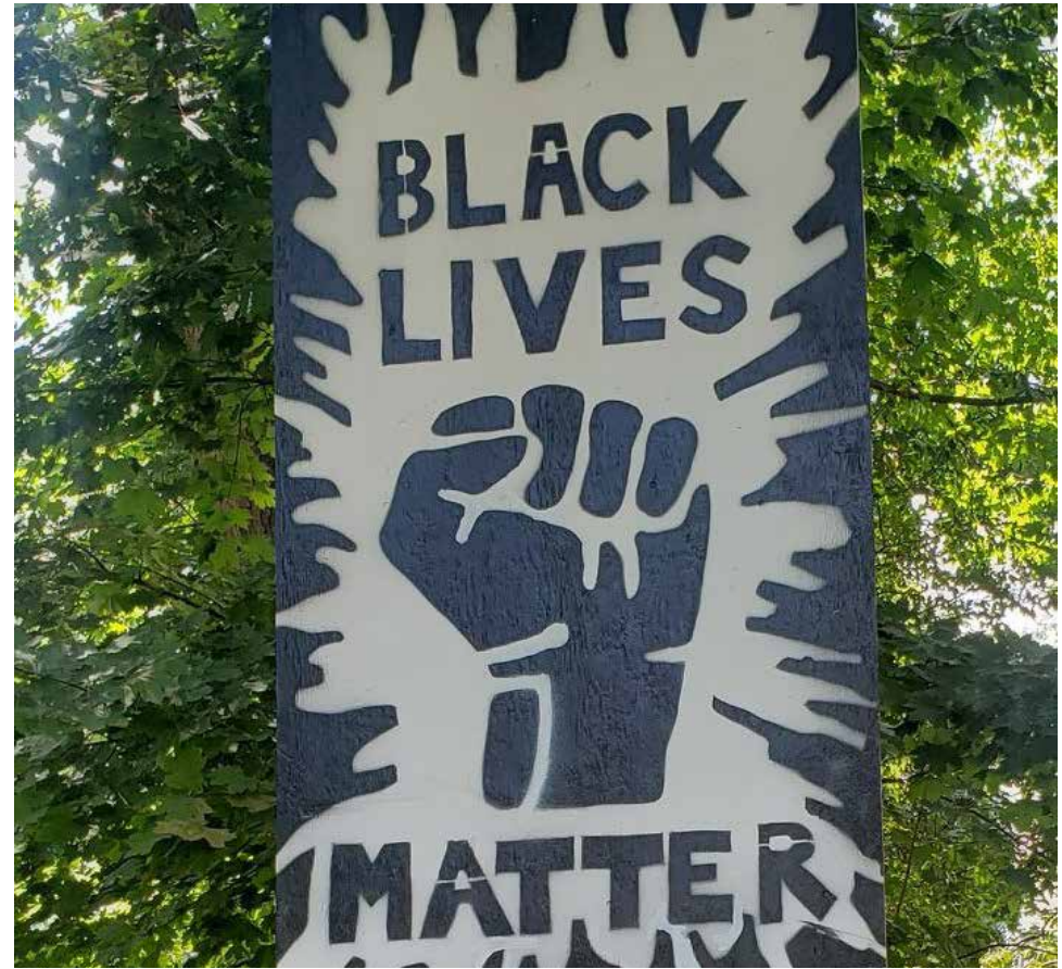
A BLM banner in Chappaqua was vandalized then burned

T-Shirt Warns Newcomers "Leave it just as you found it"