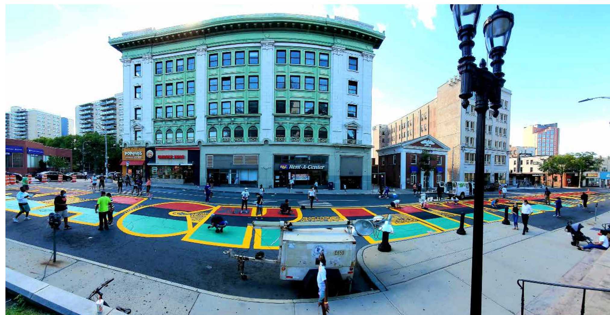
Black Lives Matter Mural on South Broadway, Yonkers.