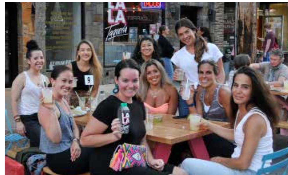
Al Fresco in Larchmont, a successful outdoor dining initiative