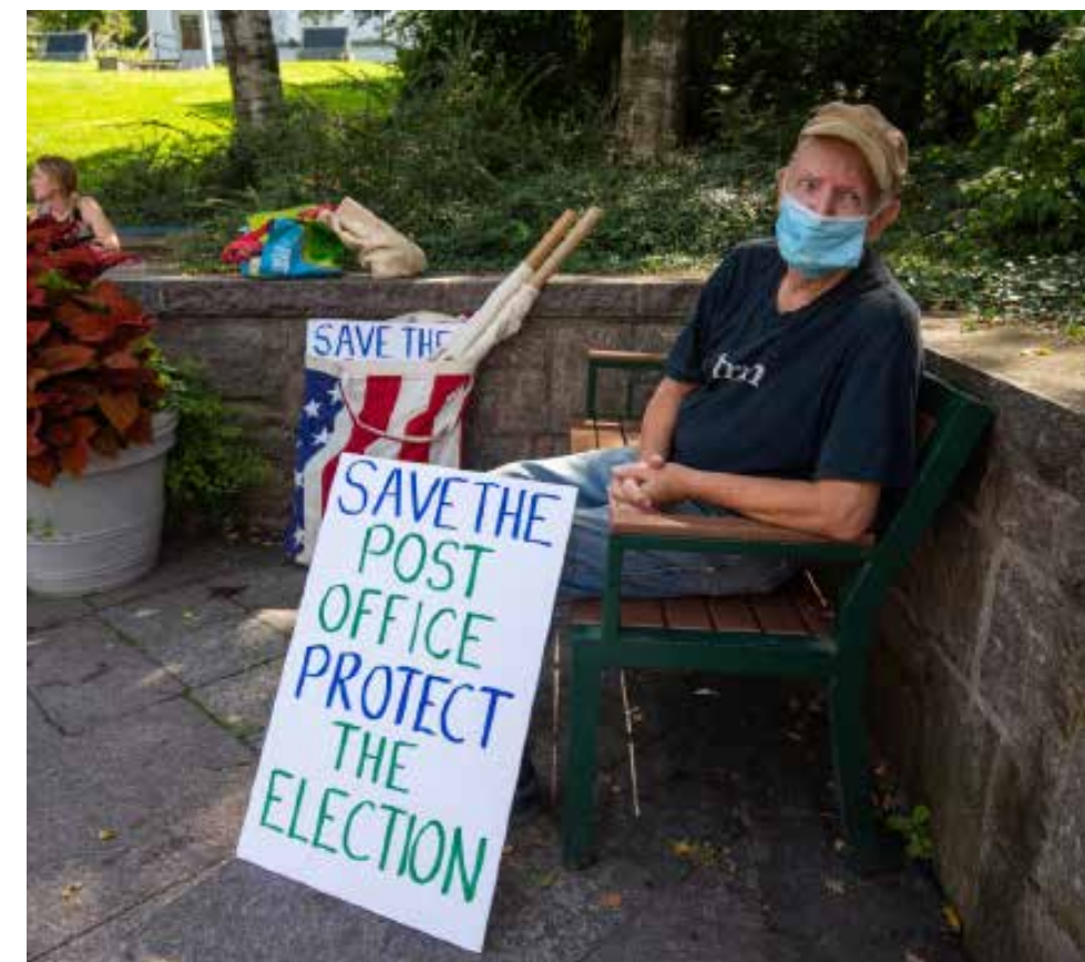
Save Our Post Office rally in Hastings