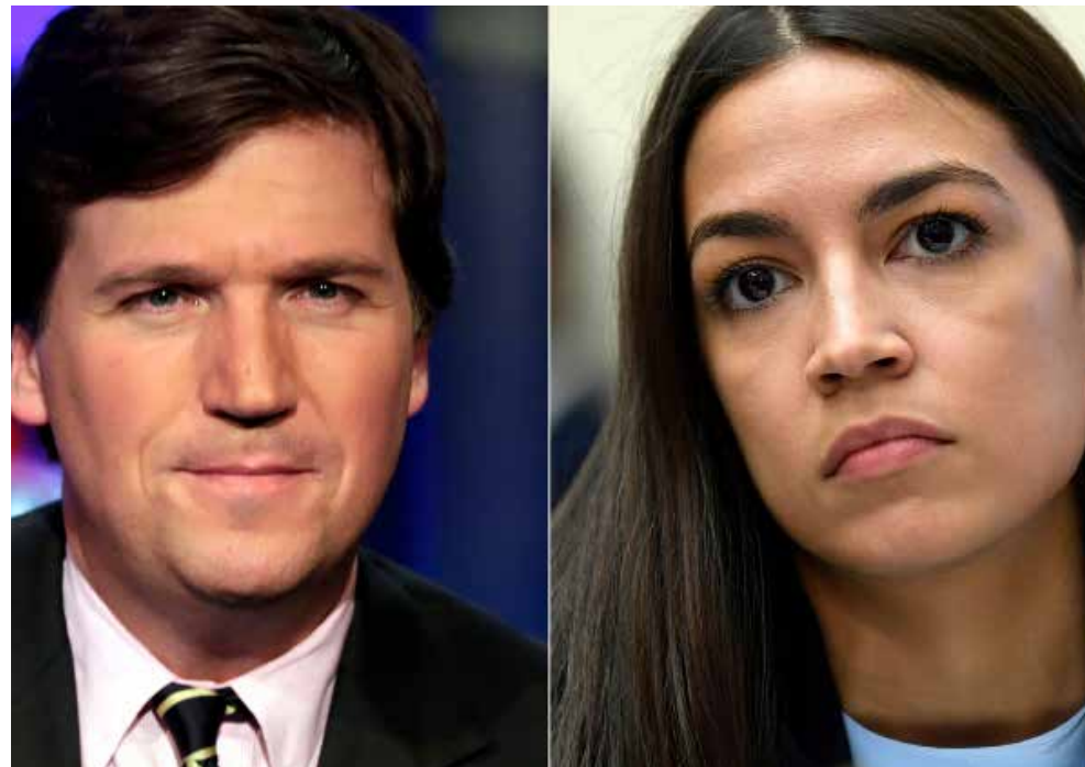
Fox News Host Tucker Carlson, and Rep. AOC, have begun a war of words which suits both sides of our political divide