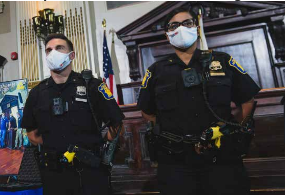
Two members of the Yonkers Police Department wearing Body Cameras that will be used in a pilot program.