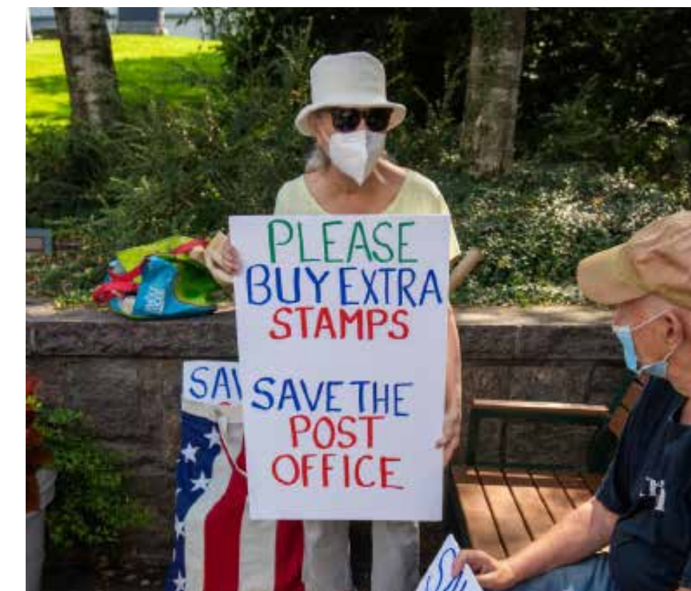
Another rallying call for the Post Office --buy more Stamps!

The financial troubles at the Post Office were exasperated during the Coronavirus, when Americans mailed fewer and fewer pieces of mail. The result from those who want to save the USPS was to have every American buy a book (or more) of stamps. Whether or not that will help bail out the Post Office is unclear, but it can’t hurt.