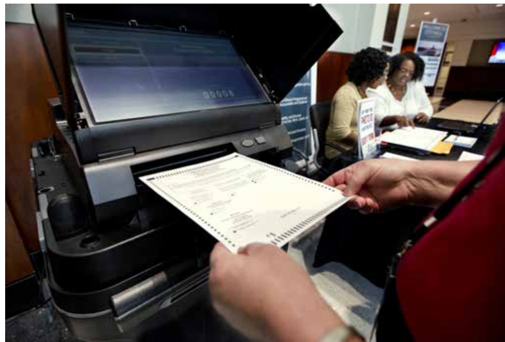
The County BOL approved $4 Million for the purchase of new voting machines, despite concerns from Indivisible and 5 legislators who voted no