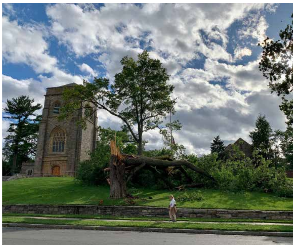
Damage from the recent storm.