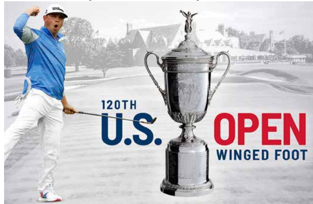
Gary Woodland, left, will defend his US Open title at Winged Foot next month