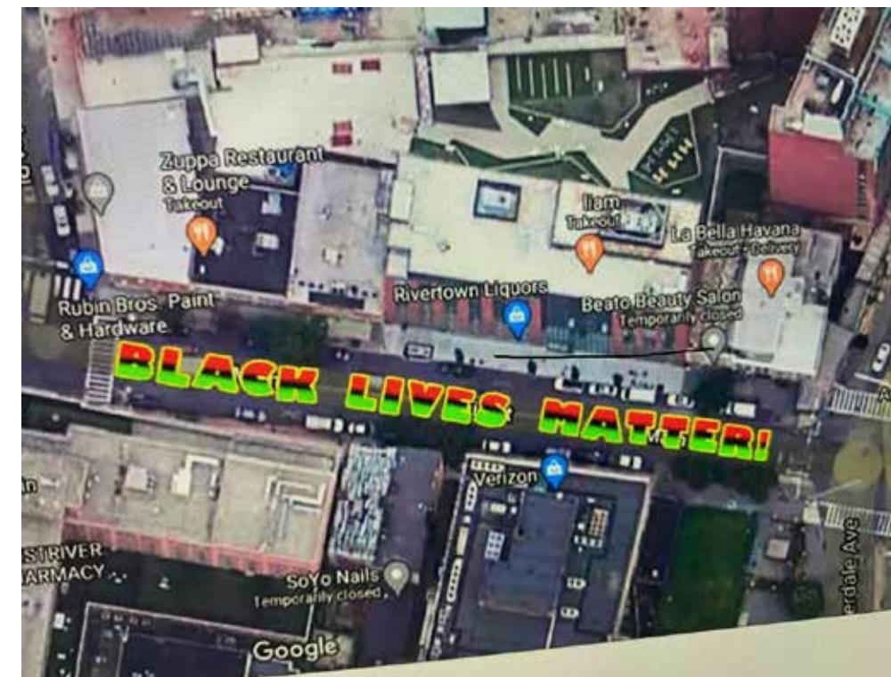
A rendering of A BLM Mural on Main Street in Yonkers