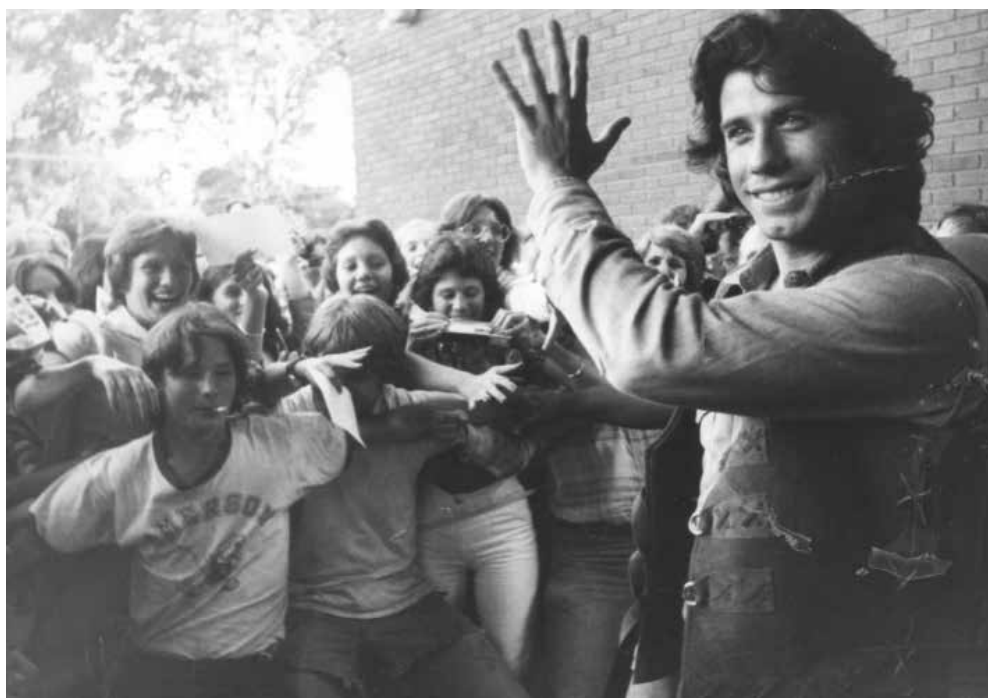
Superstar John Travolta arriving at John Burroughs Junior High School on Palmer Road to appear in a performance of Bus Stop.

August 5, 1976: Twenty-two year old John Travolta arrived at the Westchester State Theater on Palmer Road in Yonkers. He was to begin his run in the play Bus Stop, playing the role of Bo Decker. The Westchester State Theater rented the facilities at Burroughs Junior High School, now Saunders High School.