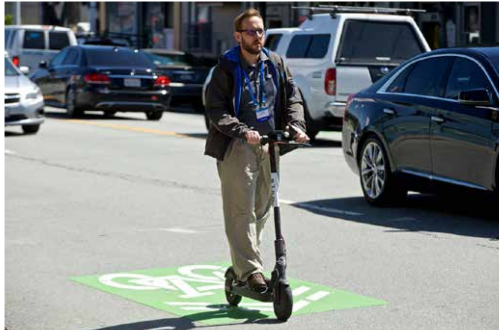
look for Bird electric scooters as you travel around Westchester

Yonkers Mayor Mike Spano announced the city has partnered with Bird to launch New York State's first-ever electric scooter pilot program. Beginning in early August, as part of a one-year pilot program, Bird will deploy up to 200 scooters in southwest Yonkers, including the Downtown-Waterfront area, with the potential of expanding up to 500 scooters to meet demand.