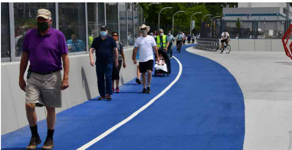
walkers enjoy the new walkway path on the Mario Cuomo Bridge

When Governor Andrew Cuomo opened the new shared use path on the Governor Mario M. Cuomo Bridge on Monday, he announced that free mobile audio tours for walkers and bikers across the path are now available for download.