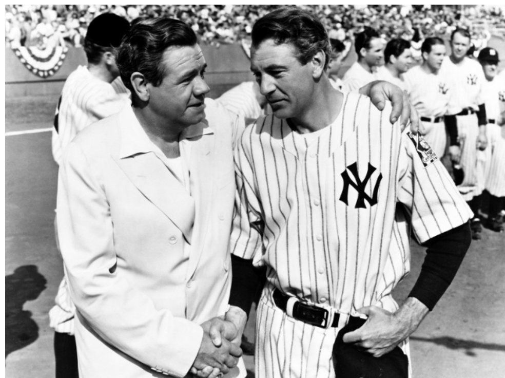
Babe Ruth, with Gary Cooper, who played Lou Gehrig in "Pride of the Yankees." The Babe played himself in the film

July 4, 2020 will mark the 81st anniversary of Lou Gehrig's retirement from baseball. A Yankees legend, famous for his 2,130 consecutive-games-playing streak, Gehrig stunned his fans when he announced he would no longer be playing professional baseball in one of the most memorable and heartfelt speeches even given in sports history.