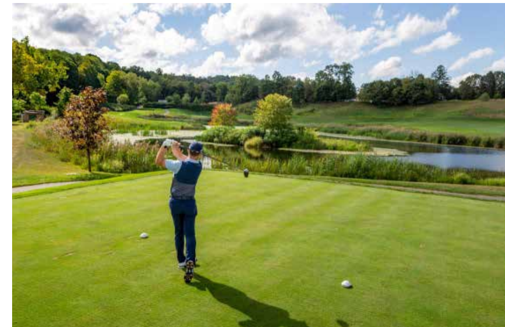
the 11th hole at Hollow Brook Golf Club

This year, interest in Golf in Westchester is at levels we haven't seen since since Tiger Woods came on the scene in 1996. Golf provides an outdoor pleasure that is easy to play safely, and also comply with social distancing.