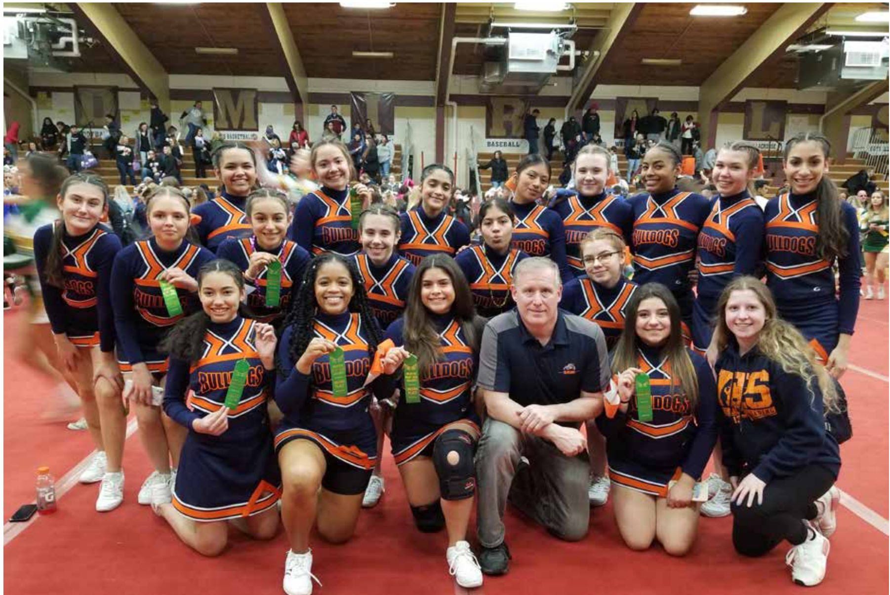
A photo of the Yonkers HS Varsity Cheerleaders from February competition. We hope to see all of Westchester's great Cheerleading teams back soon!