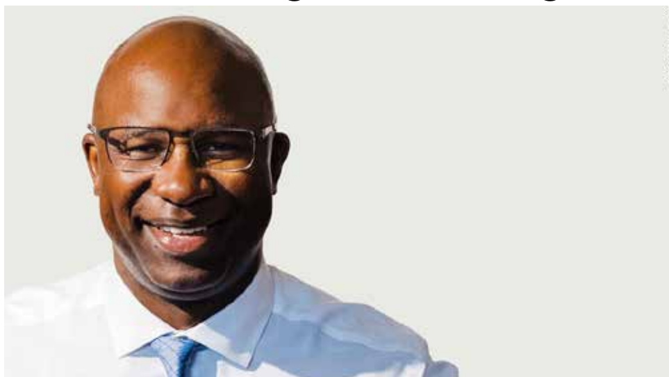
Democratic Primary winner Jamaal Bowman