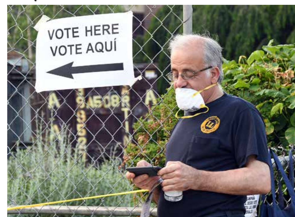
A voter waits to vote in Yonkers on Primary Day.