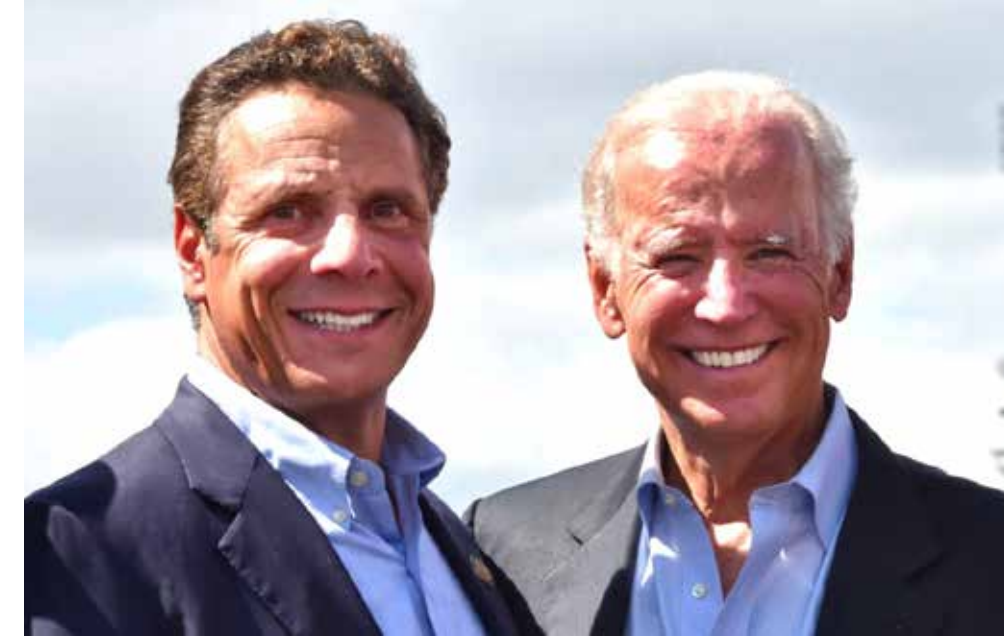
Gov. Andrew Cuomo, left, and former VP, and Presidential candidate Joe Biden.