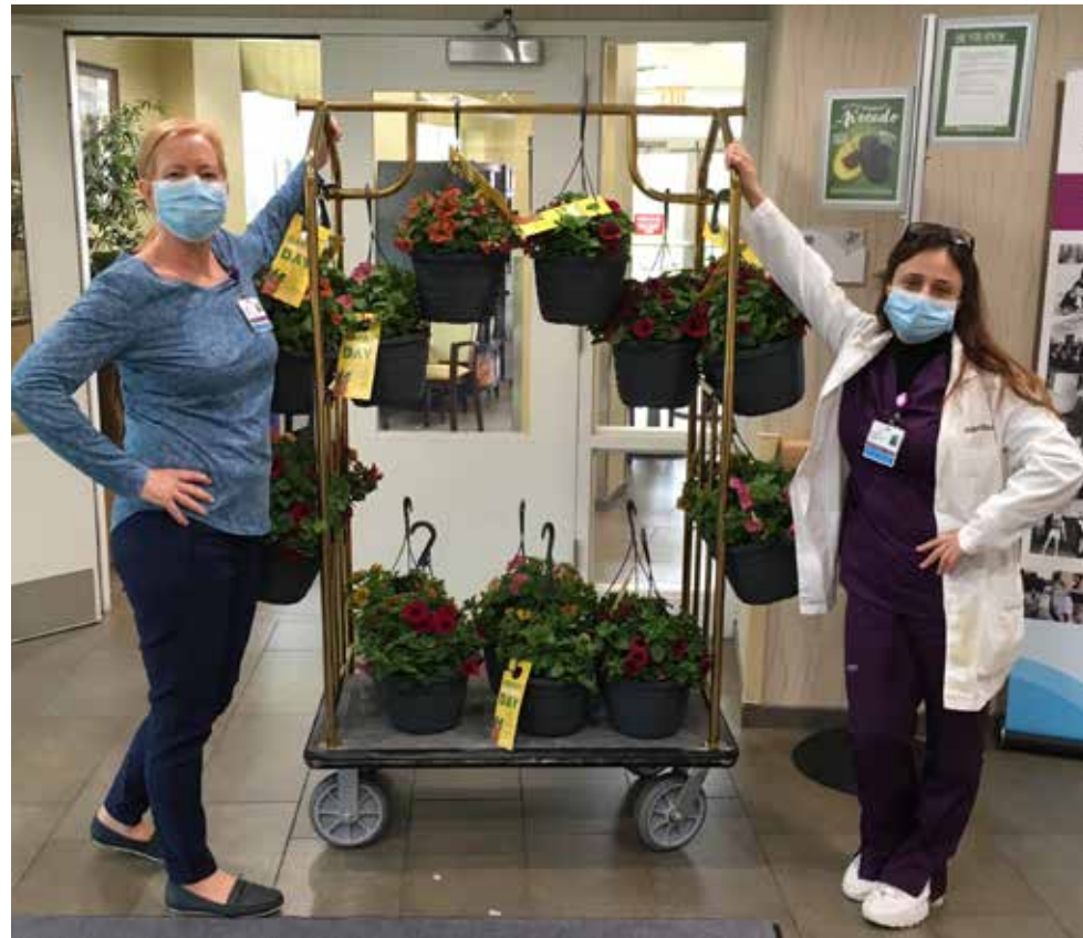
staff at Wartburg welcome donated flowers for residents and employees

Lowes Home Improvement Donated 700 Flower Baskets for Mother's Day to Residents and Nursing Staff of Wartburg in Mount Vernon. The flowers were provided by CK Greenhouses of Cheshire, CT. Lowes Home Improvement has graciously donated 700 flower baskets to moms and grandmothers at Wartburg in recognition of Mother's Day. On behalf of Lowes Home Improvement, "We know that Mother's Day may feel a bit different than in years past, and we hope this makes it a little brighter."