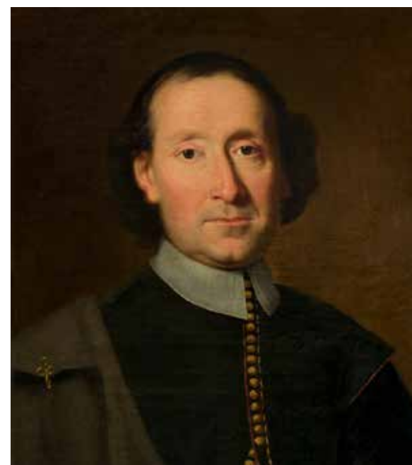
Adriaen Van der Donk, the Founding Father of Yonkers