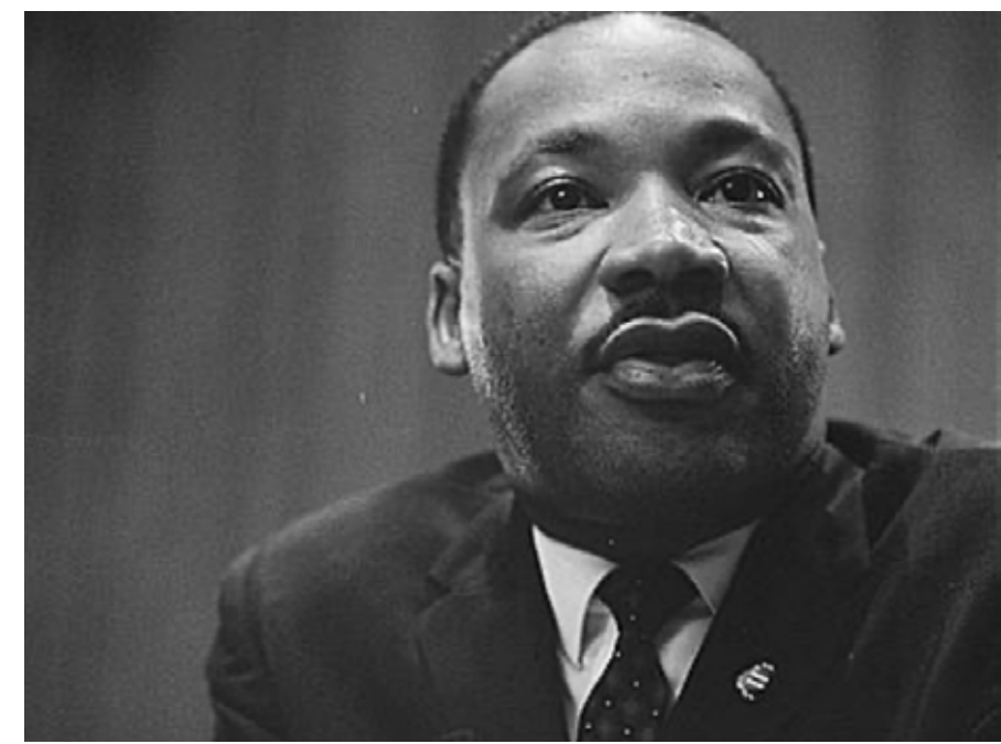
Rev. Dr. Martin Luther King Jr. visited Yonkers in 1965