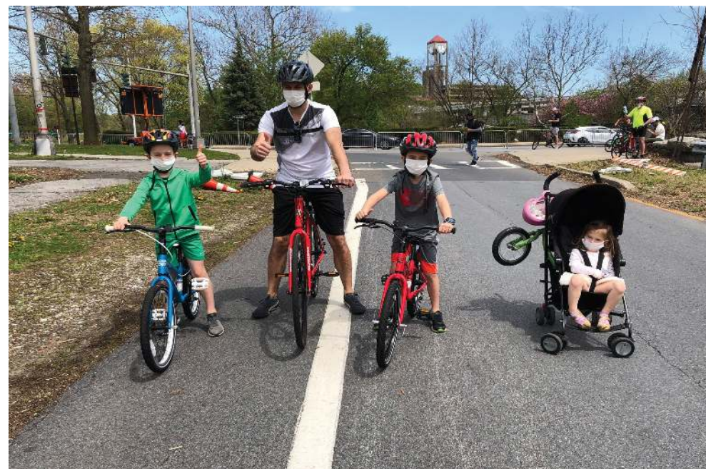
a family safely attending Bicycle Sunday 2020