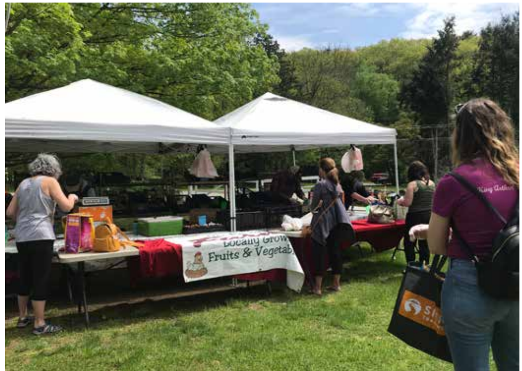
Visitors to Muscott Farmers Market last weekend, practicing social distancing and shopping with masks & gloves