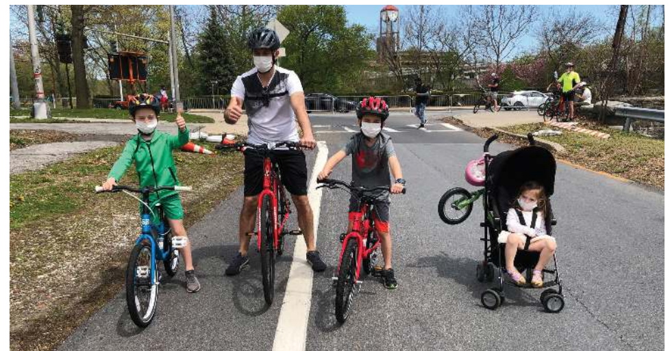
one family safely enjoys Bicycle Sunday