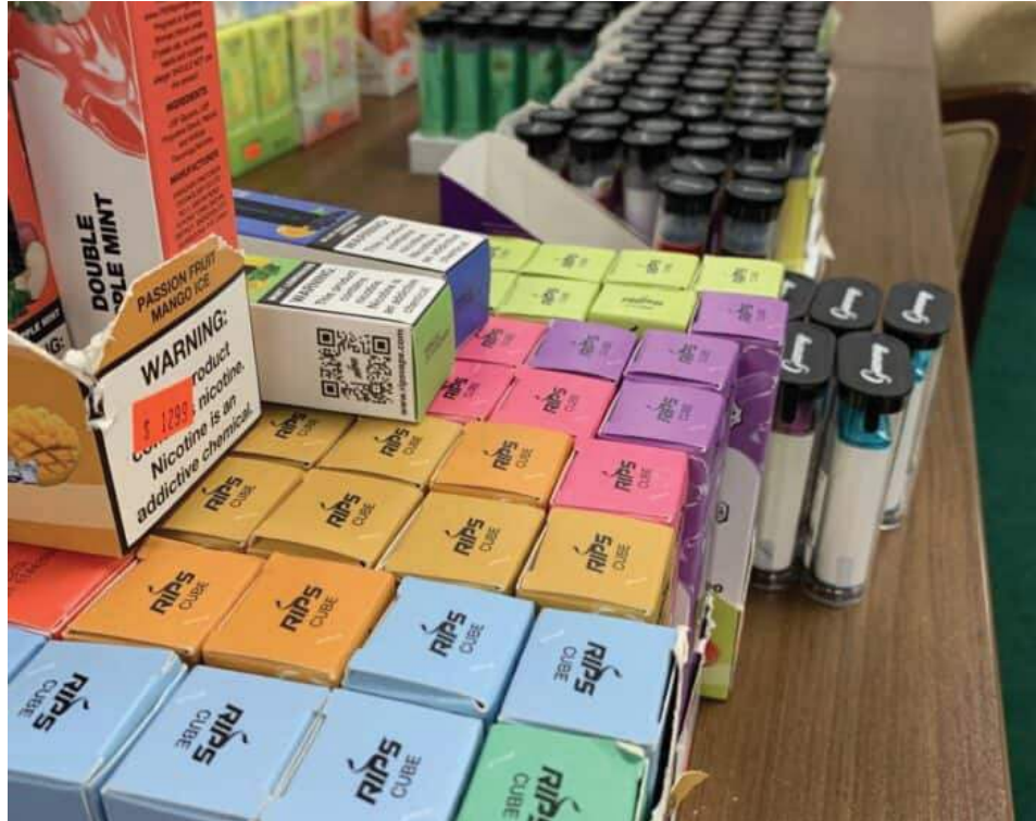
County Program Aimed at Cracking Down on Illegal and Underage Sales Continues