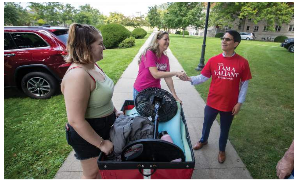
a student moves into Manhattanville College this semester

Manhattanville College has announced a significant increase in enrollment for the fall semester of this year, as they welcome more than 700 new undergraduate and graduate students this fall.