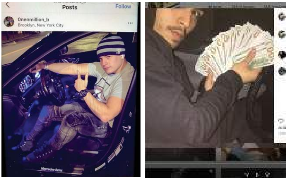
two men arrested for burglaries were found on social media bragging