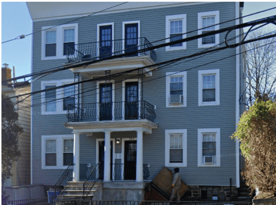
New Rochelle home at 155 Franklin Avenue where dead body was found

The New Rochelle police department reported the following: And on Friday, September 15, 2023 new Rochelle police received a report that a deceased body was seen a third floor apartment of a multi family home on Franklin Avenue. New Rochelle detectives responded and located at deceased body of a female in her twenties in the apartment.