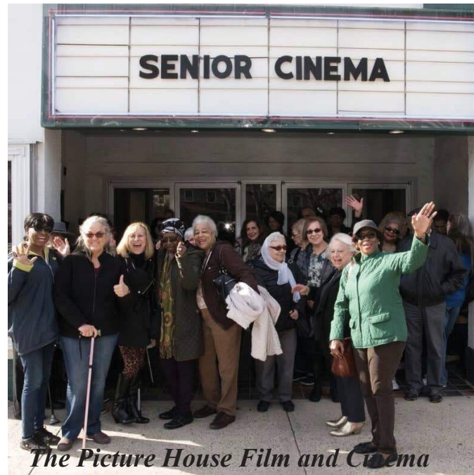
The Picture House Film and Cinema in Bronxville and Pelham

Moviegoers 65 and Older Enjoy FREE Films and Popcorn on Tuesday Afternoons at 2:30pm from September 2023 through June 2024