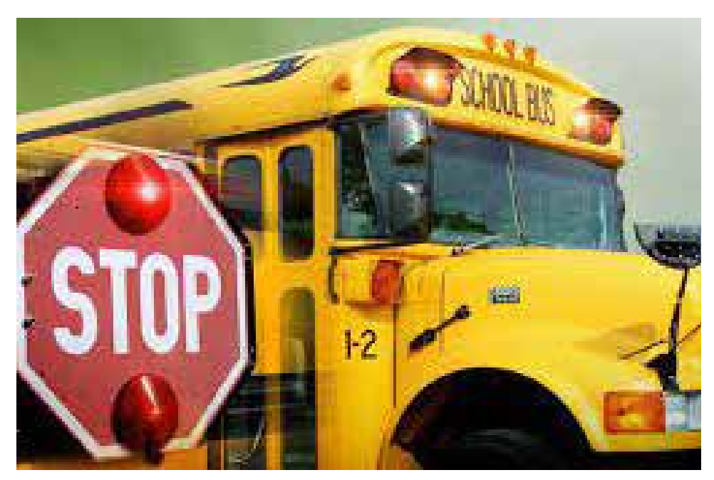
Verra Mobility's Crossing Guard Video Cam, Largest School Bus Safety Program in Westchester, to Launch October 12

On Sept. 20, Yonkers Mayor Mike Spano announced its collaboration with Verra Mobility to launch the "Yonkers Safe Stop" School Bus Safety Program. To create a safer environment, the "Yonkers Safe Stop" program will implement Verra Mobility's CrossingGuard<sup>TM</sup> school bus stop-arm enforcement solution to effectively capture stop-arm events and reduce the number of violations and injuries caused by people who disregard the school bus stop-arm.