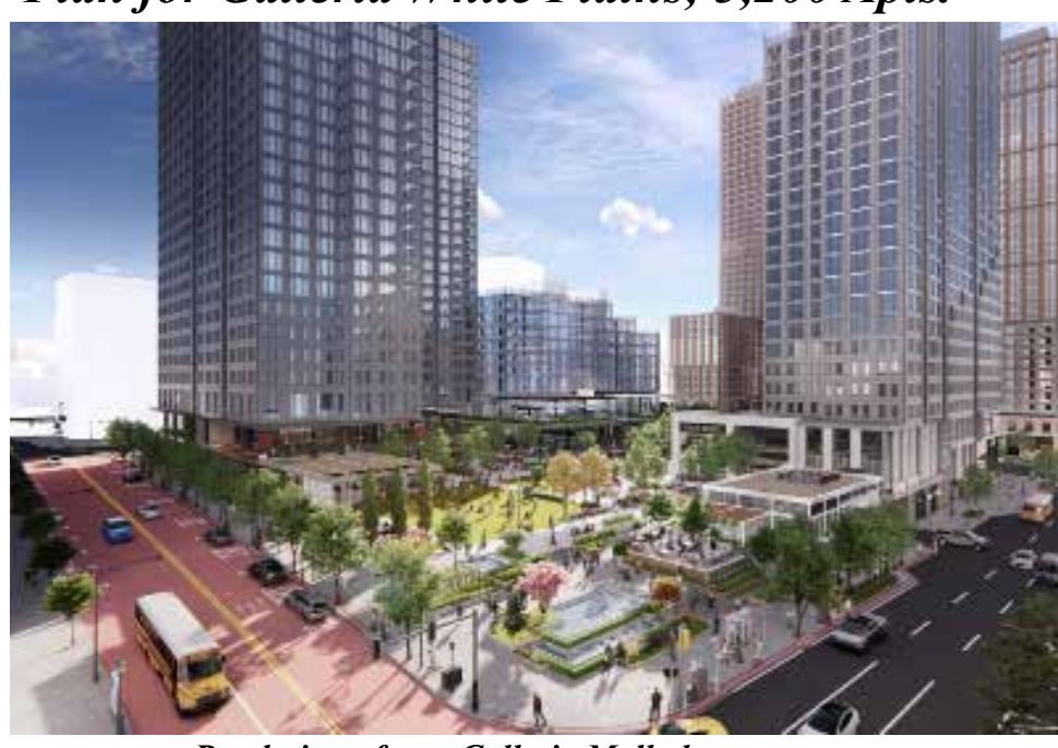
Rendering of new Galleria Mall plan

In what would be the largest conversion of an enclosed shopping mall into open space, mixed-use residential and retail in the New York Metropolitan Tri-State Region, Pacific Retail Capital Partners (PRCP), The Cappelli Organization, SL Green Realty Corporation, and Aareal Bank, owners of The Galleria at White Plains presented a plan to the White Plains Common Council. A key first step for the visionary redevelopment, spanning multiple city blocks in the heart of Downtown White Plains.