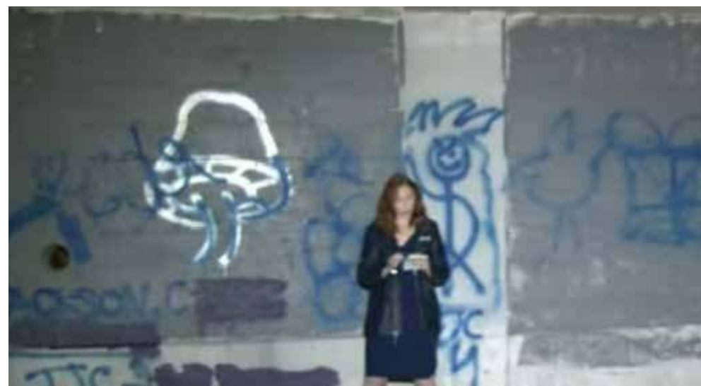
Graffiti at Yorktown highway underpass

A worldwide organization aimed at exposing and countering antisemitism through education and zero-tolerance enforcement of the law reported on an incident in Yorktown, where Yorktown Police found several antisemitic slurs spray-painted on an underpass for the Taconic State Parkway in a rural part of the town near the Croton Reservoir.