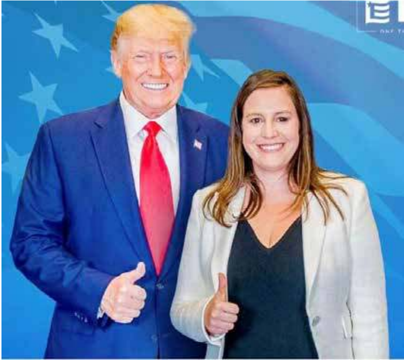
Former President Donald Trump, with Congresswoman Elise Stefanik

Is He Bringing His Next VP Candidate with Him June 6?