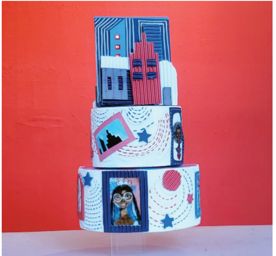
"Rhythm of Celebration" by artist Alison Cox. By: M. Trommer

As the nation prepares to celebrate its 250th birthday, local artists are marking the occasion in a uniquely creative way - with cake.