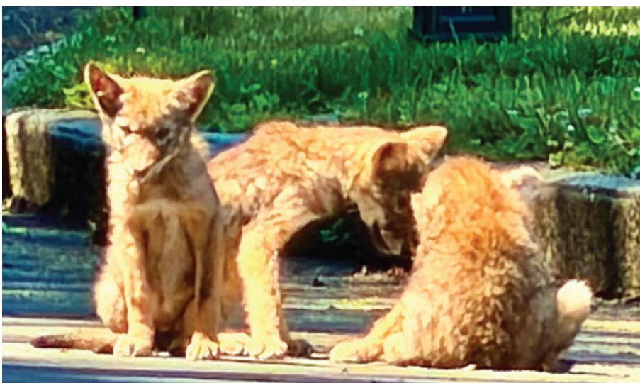
A Family of Coyotes Spotted in Cortland Manor

in District 15. And thanks to your son for his service!