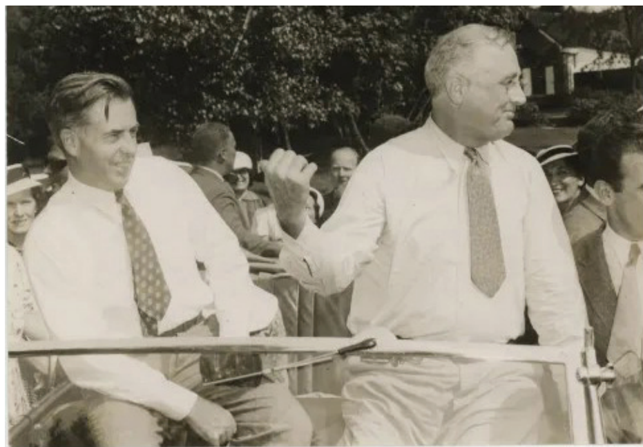
President FDR, right, with Vice-President Henry Wallace.